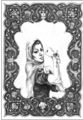
Use it gently: Pencil on paper, 32 x 50 cm, 2011