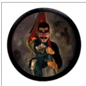
Al Mutashael: Oil on canvas, 65 Cm, 201

The double frustration of isolation, both due to the hostility of the local population towards the foreigners who were benefiting from their special status and to the geographic separation created by the desert, created an artist obsessed with the desire for freedom and encounter with the other.