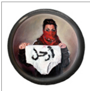
After washing: Oil on canvas, 65 Cm, 2011