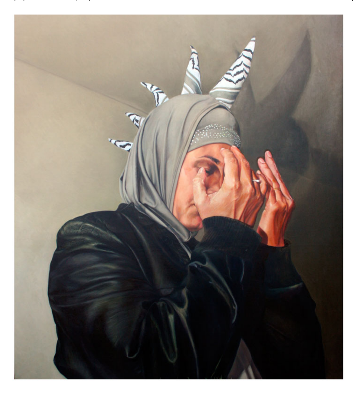
Prayers Huile sur toile, 160x200, 2015