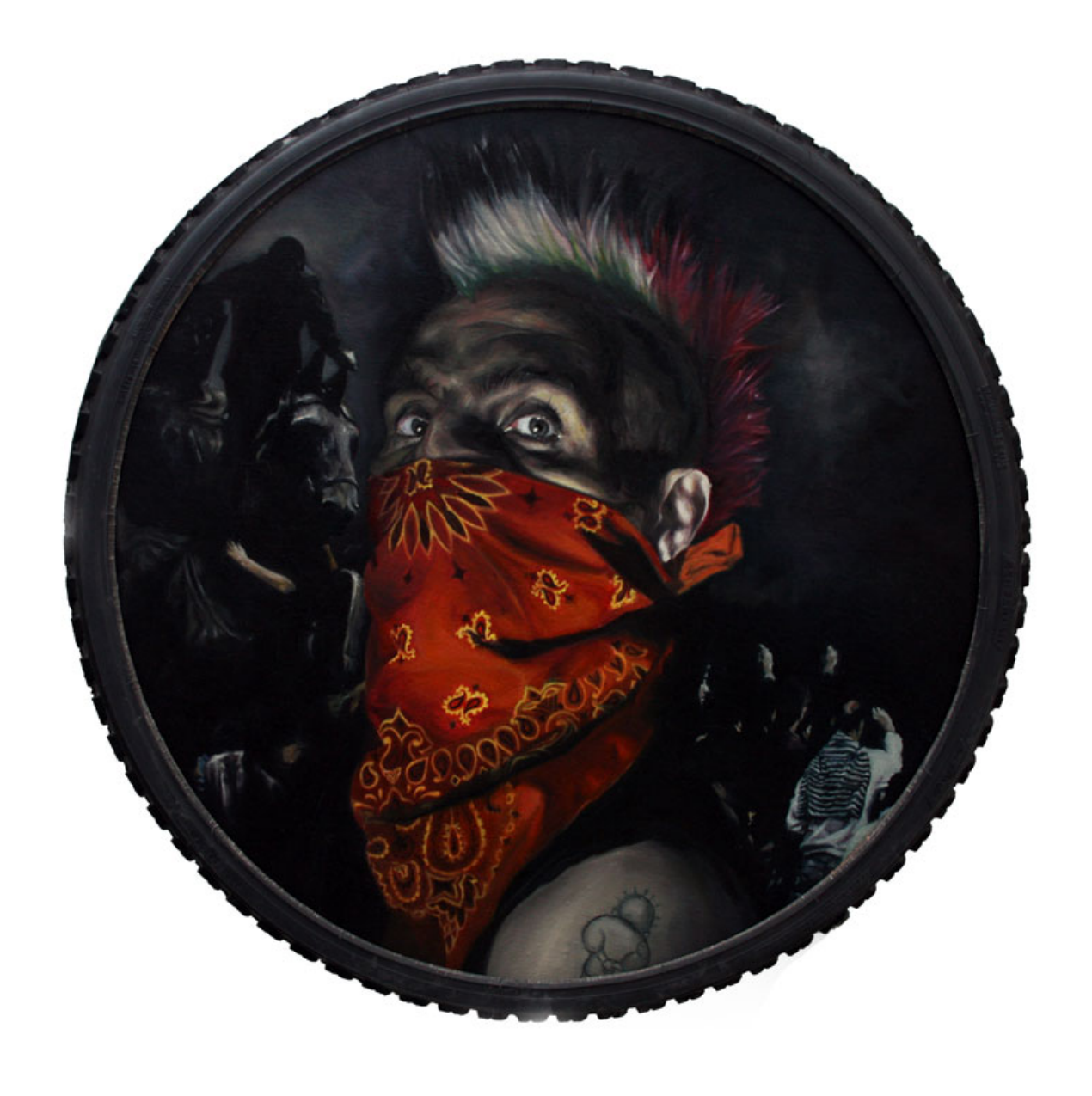
All we need is hope Huile sur toile, 70x70, 2012

What effects has Western culture had on your expression of the issues that matter to you? Has any significant change happened in your perception and interpretation?