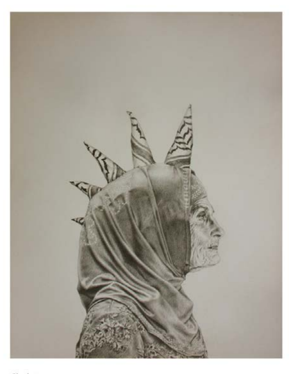
Charlotte Cravon sur papier, 42,5 x 55,5 cm, 2014 – collection privée

One of your paintings (After Washing) was censored in an art fair in Dubai. Were you glad that it was disturbing for certain masses or you'd rather not be accepted primarily as a political artist?