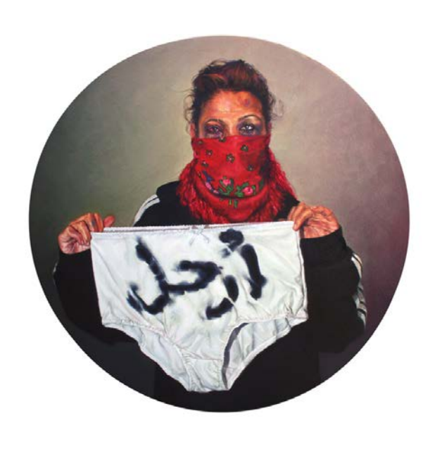
After Washing Huile sur toile, 60x60, 2011 - Private collection