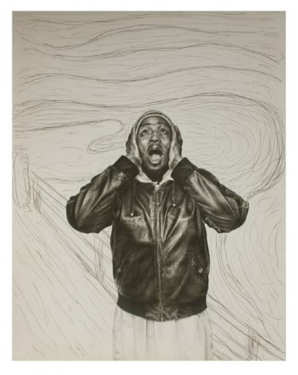
Appel à la prière Crayon sur papier, 42,5 x 55,5 cm, 2014 – collection privée

What is your main drive to produce such provocative artwork? Having lived among suppressed communities, is it the lack of artistic expression, freedom, predominating injustice or violence? What is the ultimate issue you'd like to touch through your work? I am mainly driven by injustice. I have always liked talking about dark and serious matters, but with humour. And since I am in France, I am so chocked about the indifference of the people on what happens in Palestine. I realize that the country were "human rights" were supposedly born has lost its own humanity. This society doesn't live through its senses and feelings anymore, but by its head. It gave a new and strong orientation to my artwork.