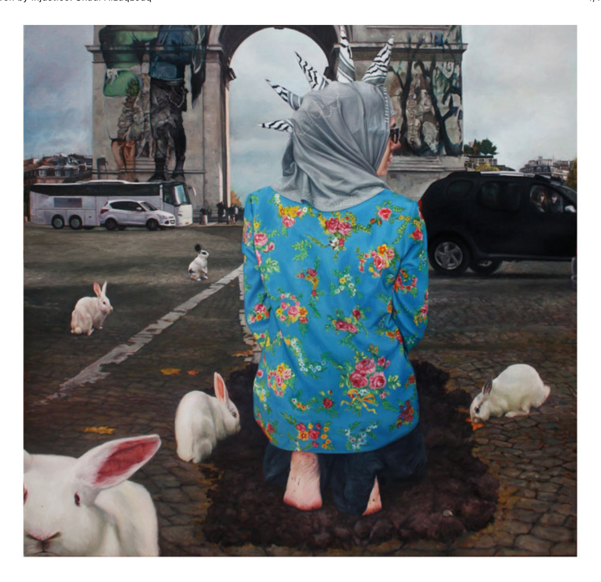
Paris Calling Huile sur toile, 100x130, 2014

You come from a refugee family, you were born and raised in exile, you moved from Al Kufrah to the Gaza Strip, leaving your father behind. While growing up, is there a specific moment/incident that motivated you to become this artist and made the most influence on your work?`