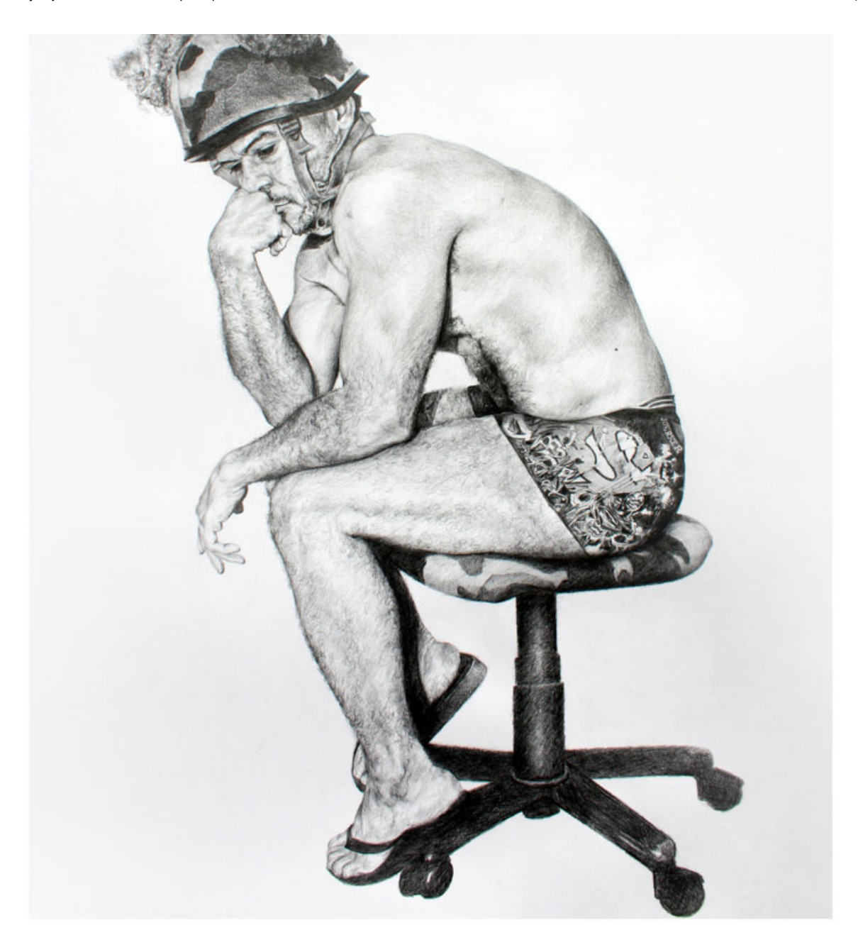
The Free-Thinker Crayon sur papier, 64x50 cm, 2012