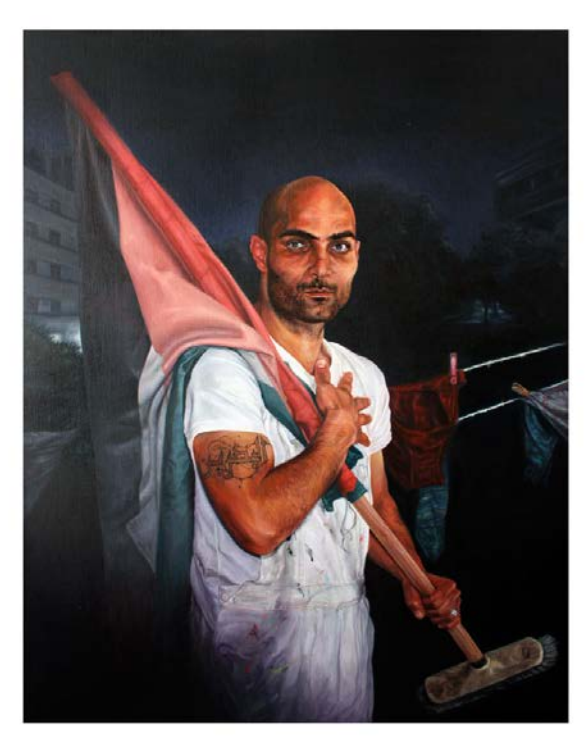
Spring Clean-Up Huile sur toile, 97x130, 2012

Me in 30 years Huile sur toile, 70x70, 2012