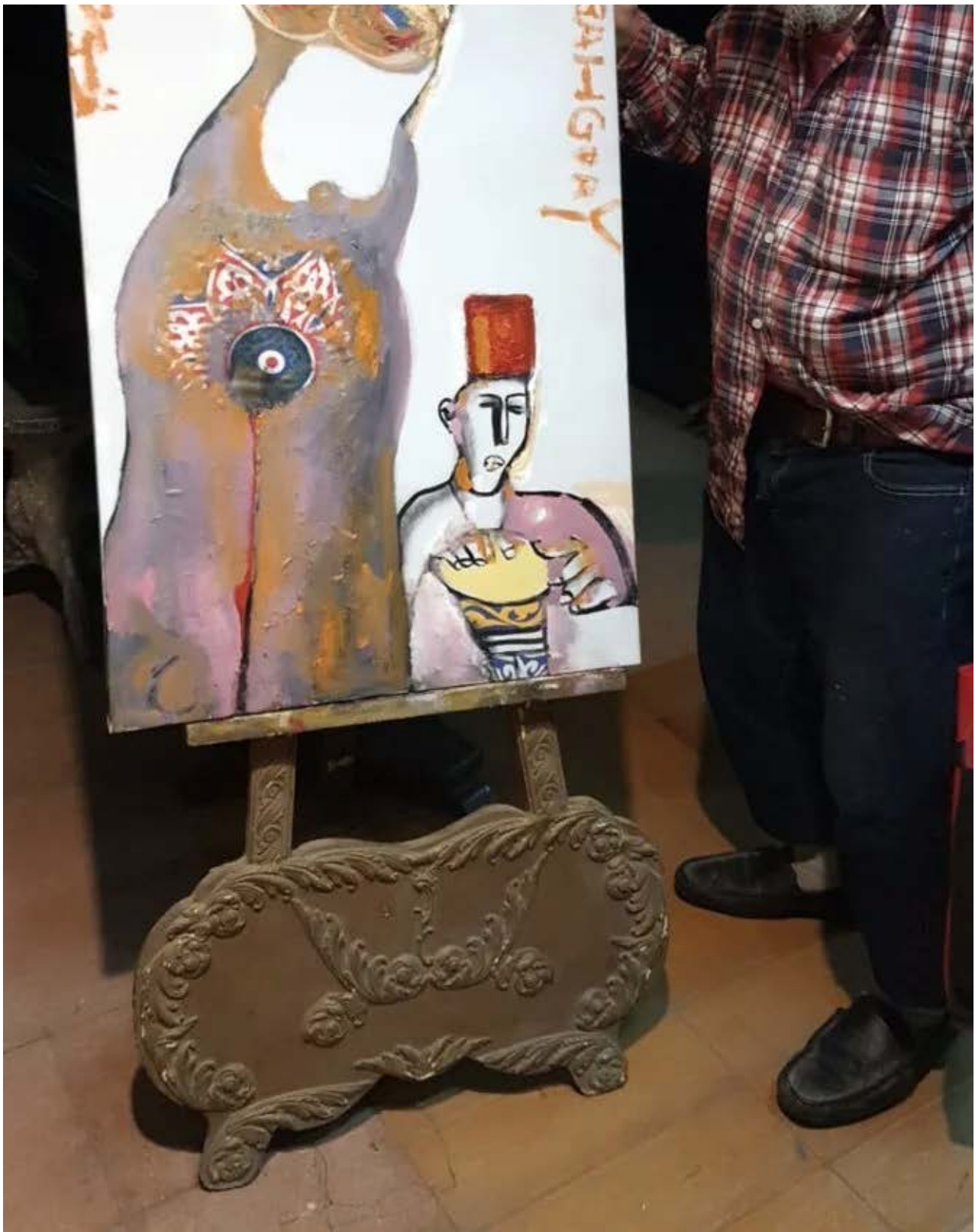
The Egyptian-French sculptor and painter donated his painting "Al-Rakassa," which is selling for $10,000.