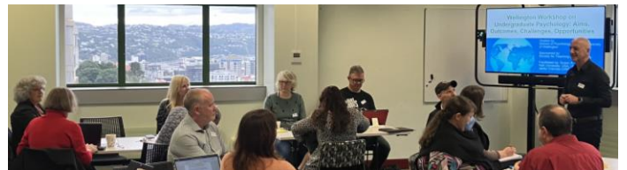
Wellington Workshop on Undergraduate Psychology Education (May 18, 2023) in Aotearoa/New Zealand (sponsored by STP)