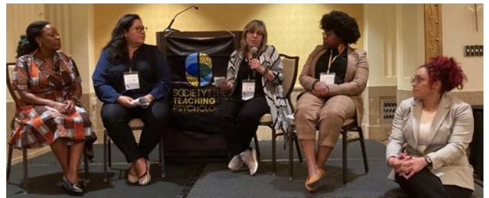
ACT 2022 Keynote: EDI: Reflections of Faculty of Color