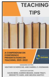
Teaching of Psychology journal and STP E-books