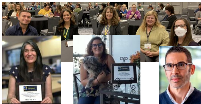
STP Award Recipients at ACT 2023 (top) and Virtual (bottom)