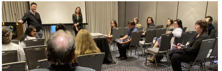
Community College Educators Affinity Group meets at ACT 2023