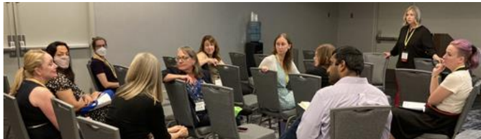
Members of STP's Membership Committees meet at ACT 2023

$35 Psychology Teachers $20 Students / Retirees $5 Members who reside in countries that are not classified as "High Income Economies"