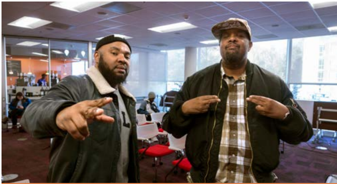
Hip-hop duo Blackalicious visited NC State in May, 2021.