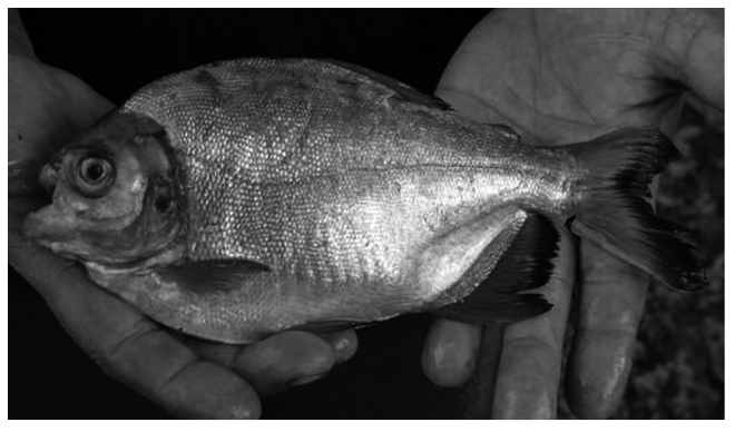
Figure 2. - Piaractus brachypomus from the Danube River (Croatia), photographed immediately after capture, total length 232 mm.

ventral scutes and gill rays) were counted under a binocular microscope