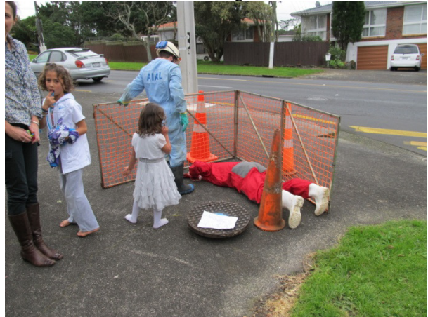
Fig.7. A manhole entrance into a cave complex under the road.

But others have had manholes put in to protect them, either in the street or in school grounds.