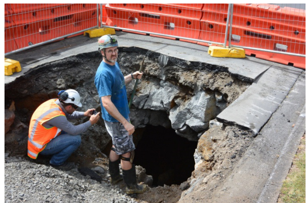
Fig. 15. Is it safe? The caver was lucky to get on site. He is wearing a helmet but no PPEs ( personal protection equipment) ie fluoro vest, long trousers, long