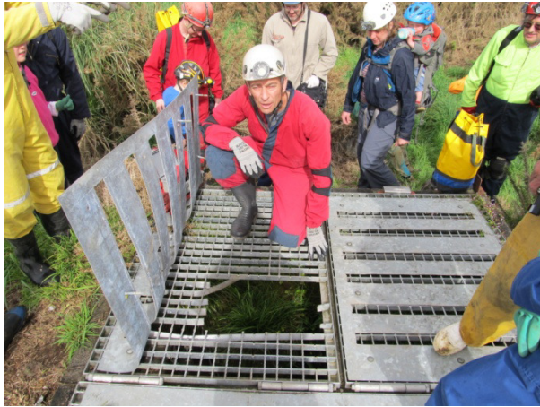
Fig. 8. A vandalized entrance to a scientific cave reserve.

Because these caves can be quite extensive they can go under several properties. So far this has not been a problem as only the entrance owners usually know where the cave goes, but it can have serious consequences if there is a cave under a property if the owner wants to do some building work. As the caves are only 1 -2 metres below the surface then only light buildings can be erected, and no digging.