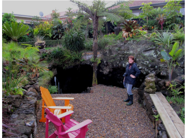
Fig. 6. A delightfull entrance to an 80metre private cave.

There are now 1.8 million people living in Auckland and there is little land now left uncovered by tar seal or housing lots. Almost all the caves are in private ownership. Some caves are part of the landscaping