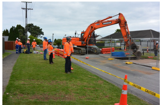
Fig. 14. Machines to make a cave digger weep!