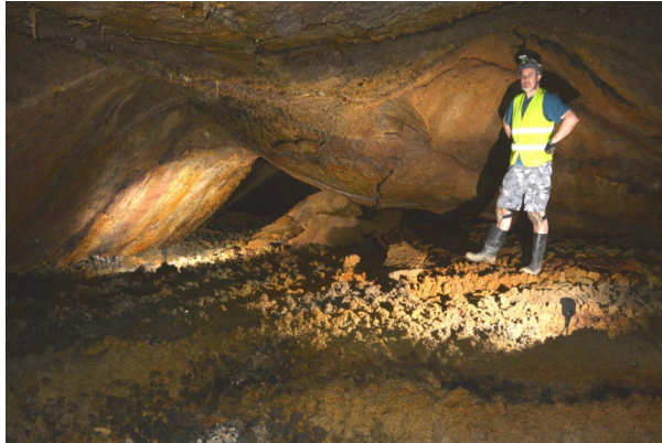
Fig. 16. A worthwhile cave but needs a engineers design to span it with a water pipe.

sleeves, gloves, induction or confined space certificates. Next time he did have everything or else he would not have been let in.