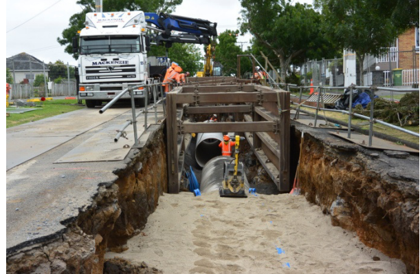
Fig. 13. The large pipe trench traversing lava cave country.

had observer safety officers inside and out of the cave. Whew! Seriously the risk of gas was important, as this was a suburban area with gas mains which can leak and two workers had been killed by an explosion in a pipe trench only recently, 1km away. It sharpens the thinking. The probable cost of the cave, tens of thousands plus the cost of a manhole to access the cave later.