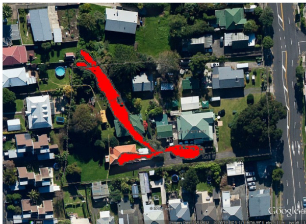
Fig. 12. The extent of the cave under the building site and surrounding houses.

The other , In December 2015 was part of a big 35km water pipe line extension construction, a multi million dollar project. It was known that it was likely to cut into caves and GPR, percussion and boreholes were done in advance and then an exploratory dig. A cave was found. The council was told. Iwi came and blessed it. The archaeologist walked by. Nobody could go in. It was a construction site. I was called in. I was allowed to go in briefly after inductions for the site with all PPEs (hard hat, boots, long trousers long sleeves, gas meter and signing off. A very quick survey on the back of a hand was enough to determine it was worth keeping. To do the proper survey, which also included a 3d laser survey, we had to spend a morning getting more inductions, drug tested, and two days to get a ‘confined spaces certificate’. At the site we were signed in, the cave was gas tested , we also wore gas meters and we