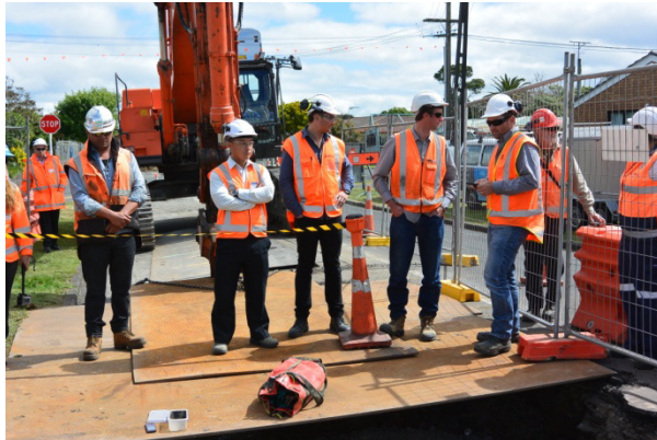
Fig. 17. Caving is a spectator sport.