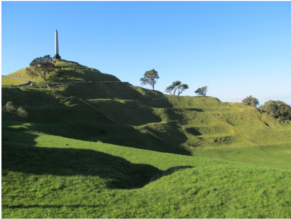
Fig. 4. Fortification and storage pits around one of the scoria cones.

remain open have been pillaged for souvenirs or fertilizer. However, there is a resurgence of maori values and the heritage values are beginning to be recognized.