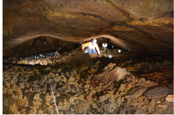
Fig. 19. The old and the new. On the left is the compass and tape survey. On the right is a $50,000 3D laser scanner. The white spheres are the control points.

Interestingly, at the end of the cave I found some recent fill that a just completed house builder had put into a hole he had created. No notification. No extra cost except a bit more concrete.