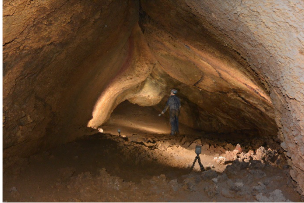
Fig. 11. The ceiling of this fine cave is only 80cm below ground causing concerns about the danger of collapse.

designs and persuading them that the house next door would not fall down even if it had already been there a hundred years. The owner estimated it cost him 80k in delayed time and permits.