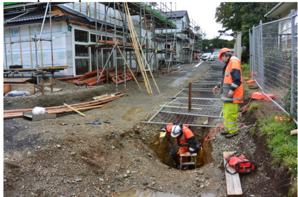
Fig. 10. The cave is at the near end of the trench. The developer was stopped from filling in the trench which hampered deliveries to the building sites. The cave extends to left and right of the picture.

One a private developer doing infill housing, found a cave in a trench and let the council know. I was rung up as no one was willing to enter and I am known for being able to explore and survey. So I did a survey both with tape, compass and camera.