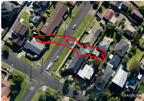
Fig. 18. The mapped extent of the cave. The water pipe will go up the right hand side of the road. There was a break in at the right hand lobe of the cave that had not been reported.