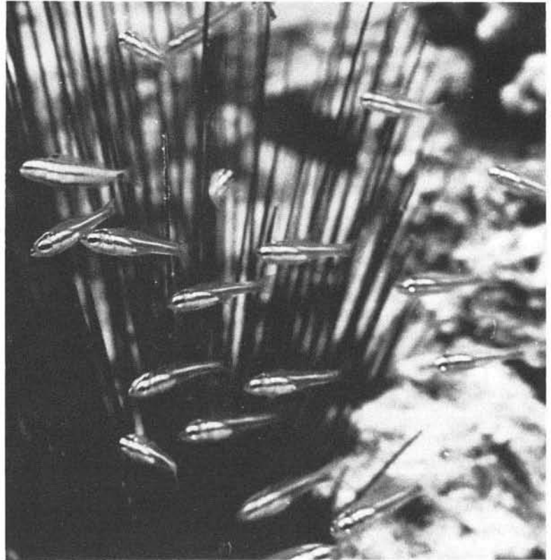
Fig. 1. Underwater photograph of a 15 mm Meiacanthus nigrolineatus (at the upper left corner) among Apogon cyanosoma (Eilat coral reef, 8 m)