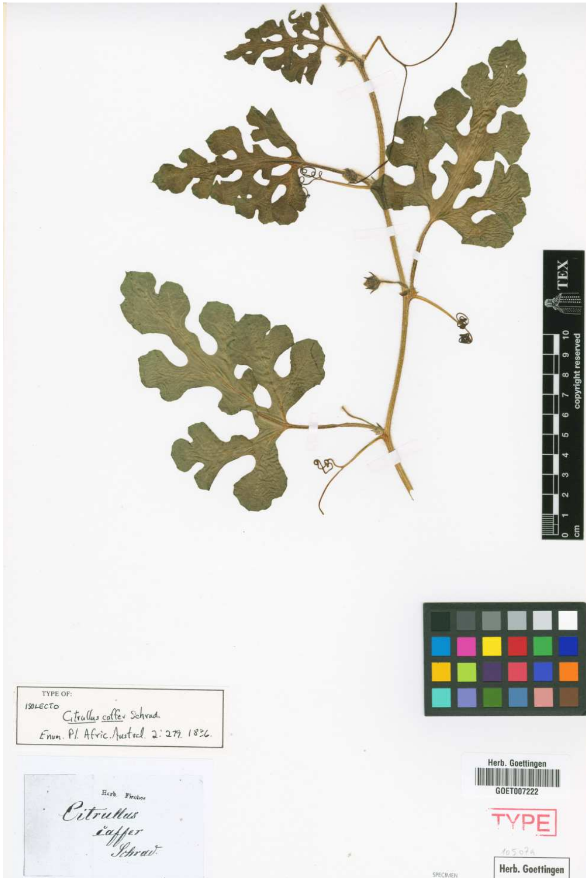
Figure 2. Isolectotype of Citrullus caffer Schrad. (GOET). See text.