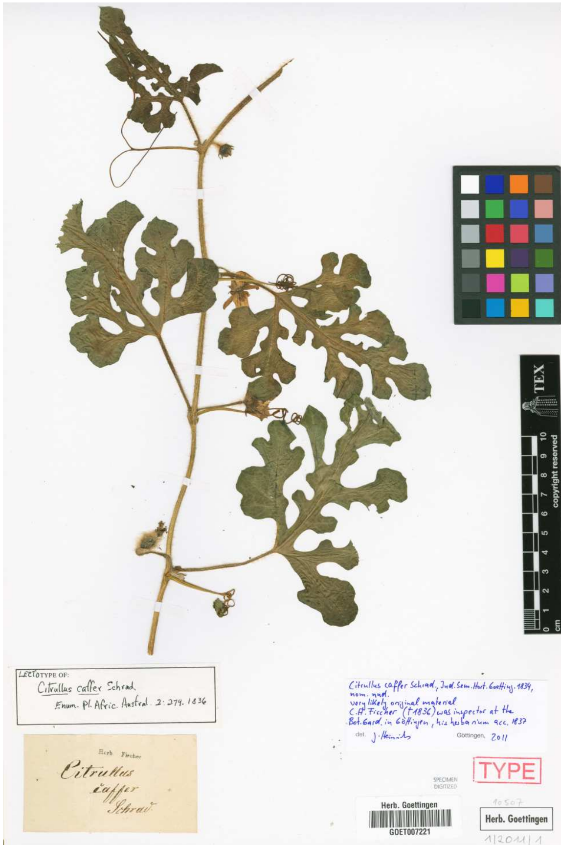
Figure 1. Lectotype of Citrullus caffer Schrad. (GOET). See text.