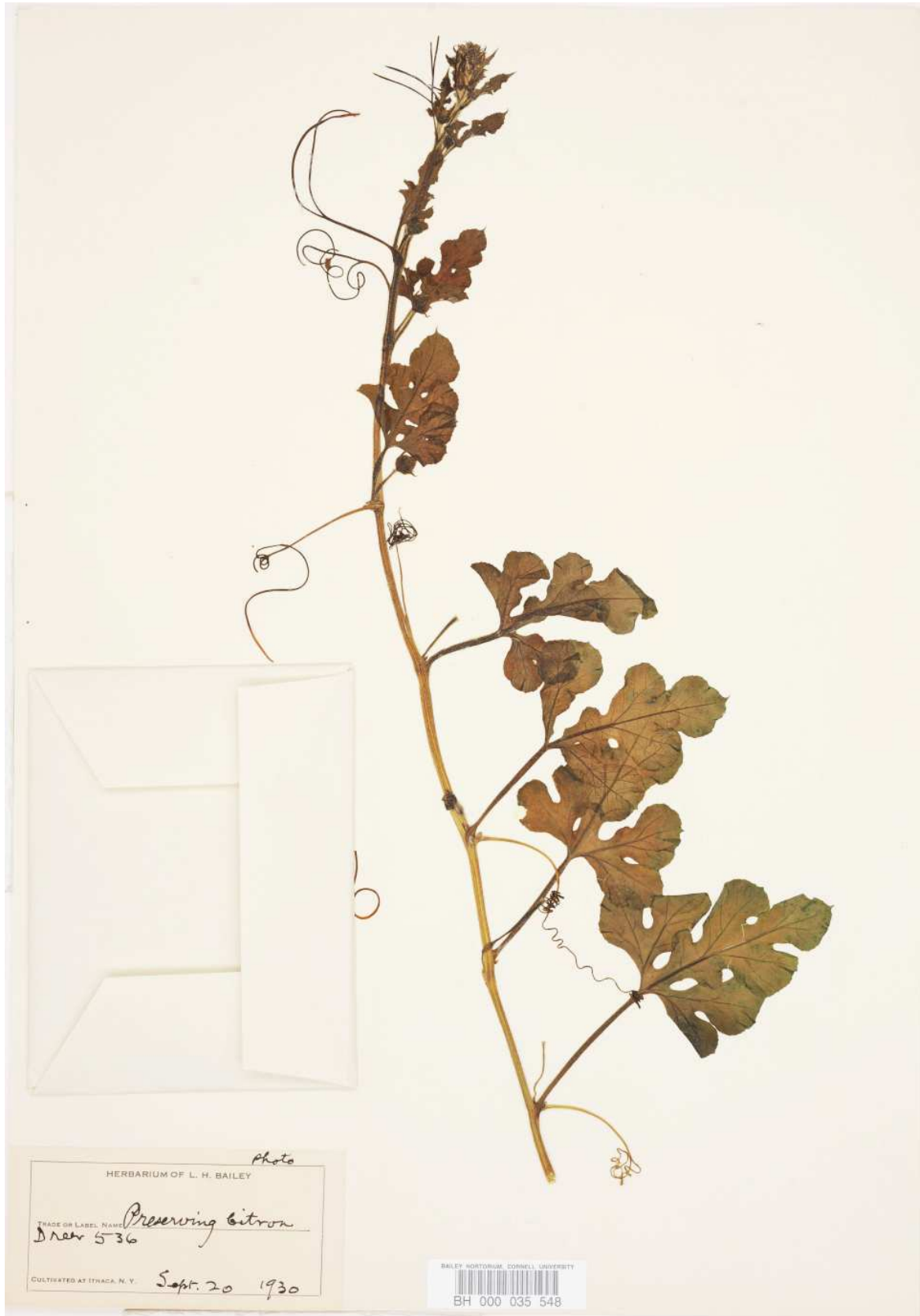
Figure 4. Lectotype of Citrullus vulgaris var. citroides L.H. Bailey (BH). See text.