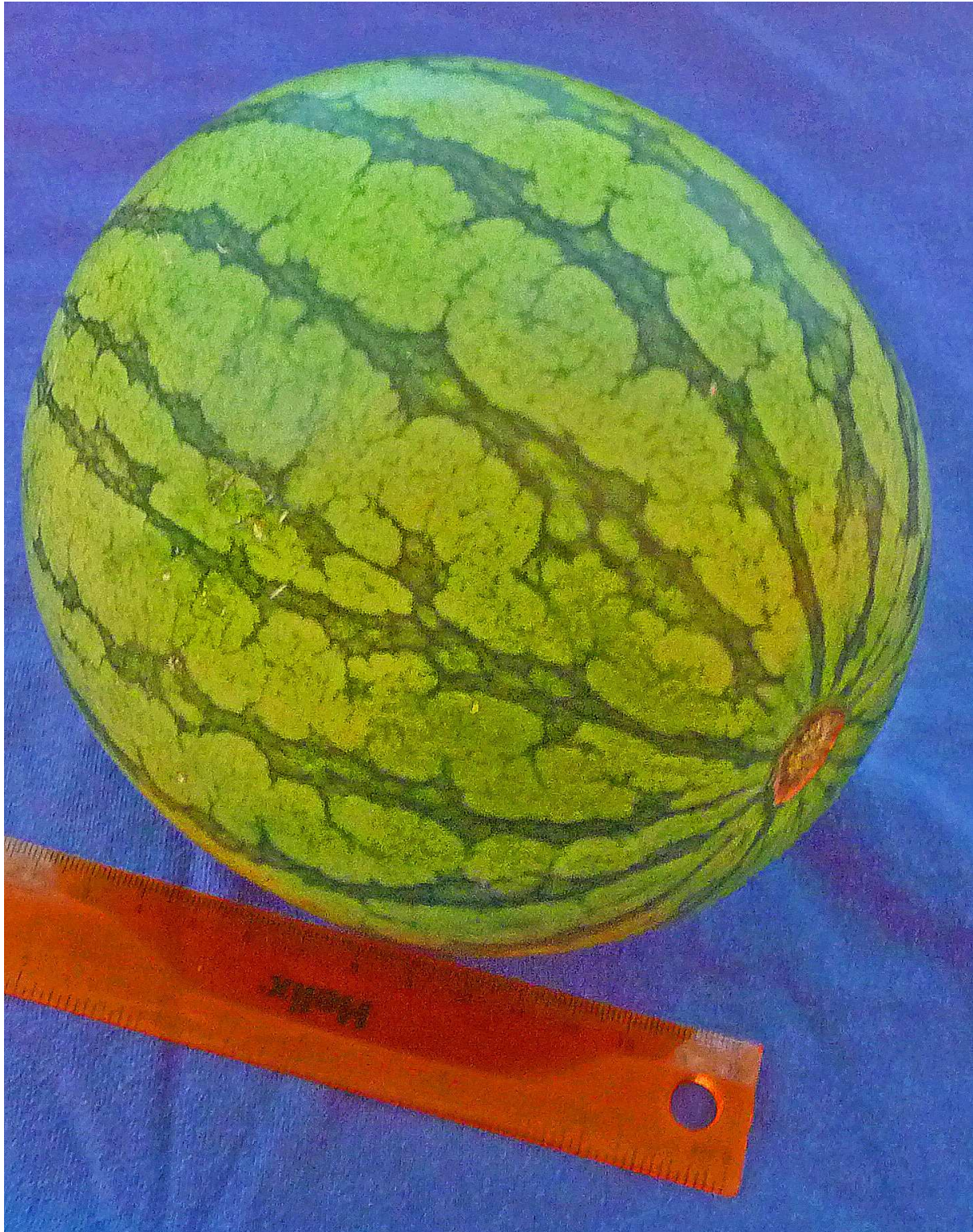
Figure 5. "Mini seedless" triploid watermelon, Citrullus lanatus , at the end of its remarkable odyssey beginning from a small, fertile-diploid, bitter-flesh African ancestor. This one was grown in Mexico, according to its label.