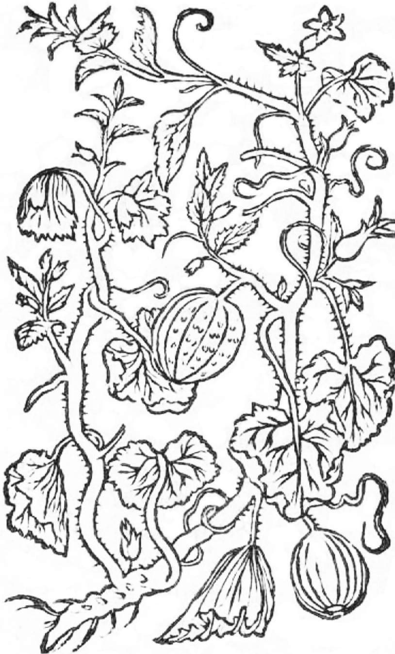
Figure 6. "Melones" in Bauhin and Cherler's Historia Planta Universalis (1651, vol. 2, p. 242). The page with the illustration was cited by Linnaeus in the 1753 protologue of Cucumis melo . Along with the protologue and lectotype, this illustration and the one from Morison's Plantarum Historiae Universalis (in Fig. 5) provide a fuller morphological formulation of Linnaeus's concept of the species and of C. melo var. melo in the strict sense.