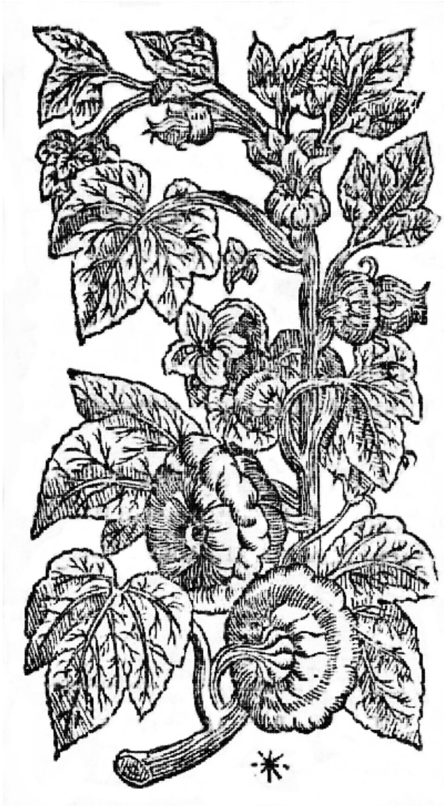
Figure 8. Cucurbita clypeiformis from Bauhin and Cherler, Historia plantarum universalis 2: 224. 1651. The page with this illustration was cited by Linnaeus in the protologue of Cucurbita melopepo L. (1753) and the illustration is designated above as the lectotype of the species.