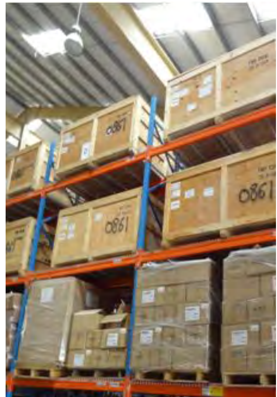
Storage crates at the ANA Central Supply Depot, Kabul.

The U.S. and coalition partners provide weapons to the ANSF according to the quantity and type agreed upon in the Tashkil—the Afghan government’s official list of requirements for the ANSF. The Tashkil has changed over time, with some weapons requirements increasing and others decreasing. SIGAR found that, as of November 2013, more than 112,000 weapons provided to the ANA and ANP exceed requirements in the current Tashkil. In some cases, excess weapons were provided because ANSF requirements changed. For example, the ANA has 83,184 more AK-47s than needed because, prior to 2010, DOD issued both NATO-standard weapons, such as M-16s, and non-standard weapons, such as AK-47s. After 2010, DOD and the Afghan Ministry of Defense determined that interoperability and logistics would be enhanced if the ANA used only NATO standard weapons. Subsequently, the requirement was changed. However, no provision was made to return or destroy non-standard weapons, such as AK-47s, that were no longer needed. DOD officials told SIGAR that they do not currently have the authority to recapture or remove weapons that have already been provided to the ANSF.