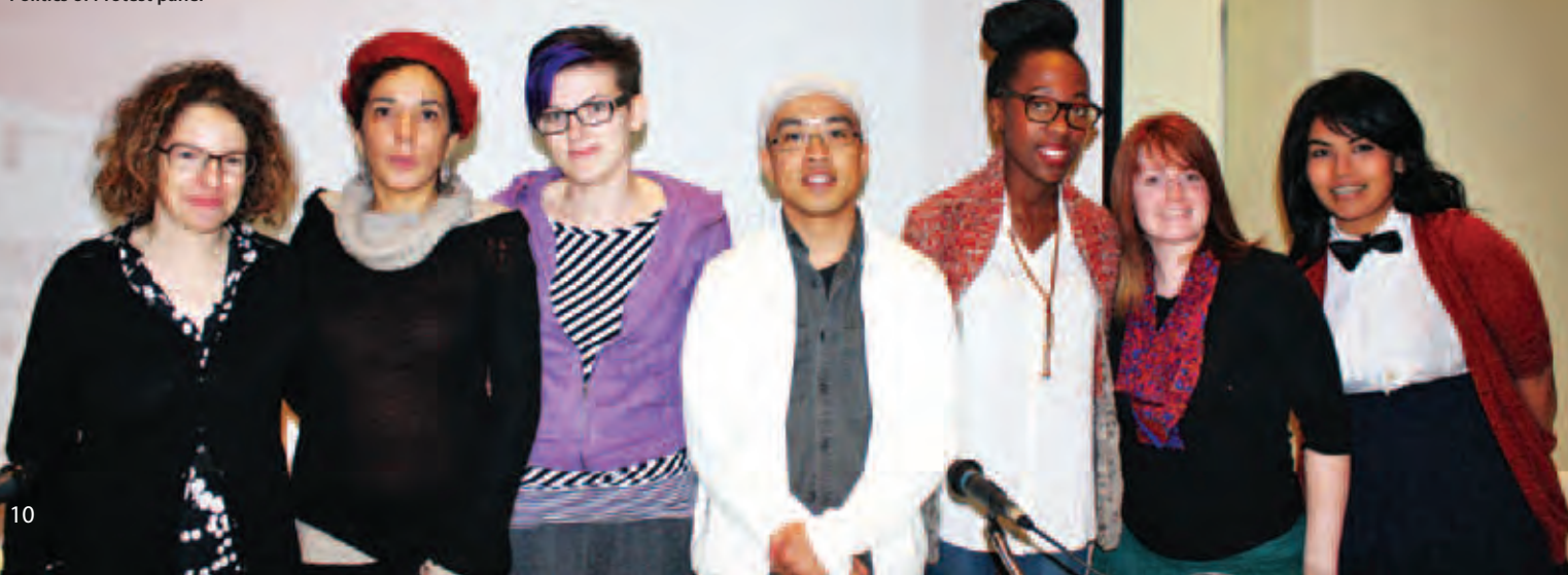
Politics of Protest panel

Our WGS Student Union could not have been more dynamic this year, producing a conference attended by hundreds of students, film screenings, socials, and talks, featured here in the Newsletter in more detail. We look forward to working closely with the WGSSU next year to create several exciting initiatives and events, some to honour past recipients of the City of Toronto Women's Studies scholarships, and to inaugurate the new graphic novel collection at the D.G. Ivey Library at New College.