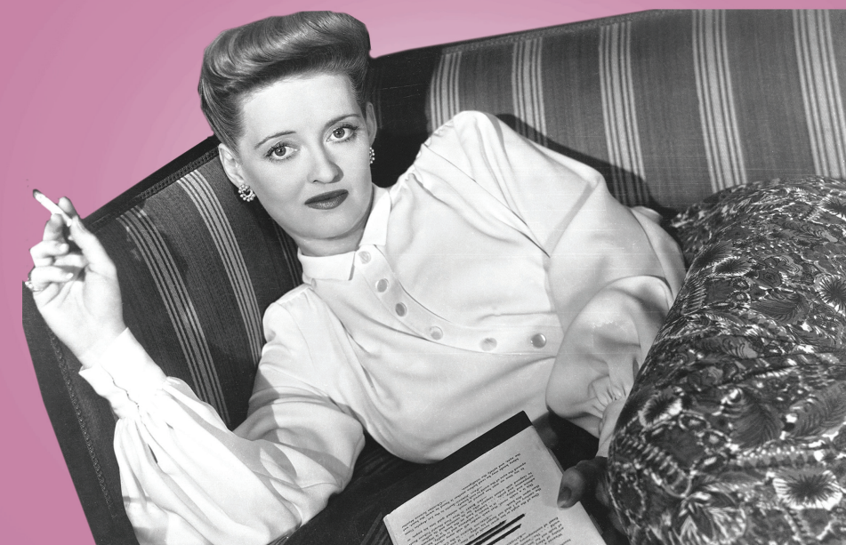
Now Voyager ('42)

DAYTIME THEME(S): DIRECTED BY WILLIAM A. SEITER PRIMETIME THEME(S): STARRING MEL GIBSON 8:00 PM The Bounty ('84) F 10:30 PM Mad Max ('79) 12:15 AM Ransom ('96) 2:30 AM Mrs. Soffel ('84) 4:30 AM The Year of Living Dangerously ('82)