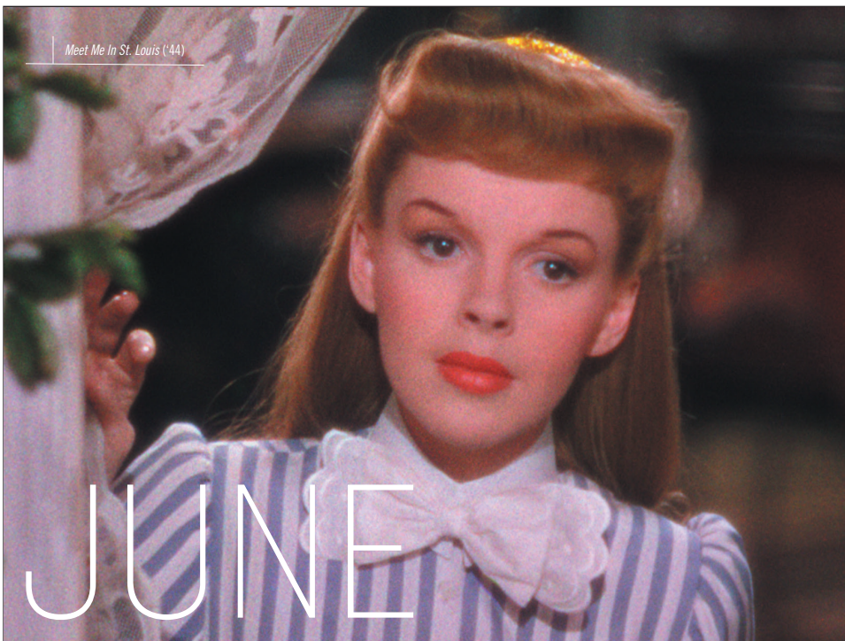
Meet Me in St. Louis ('44)