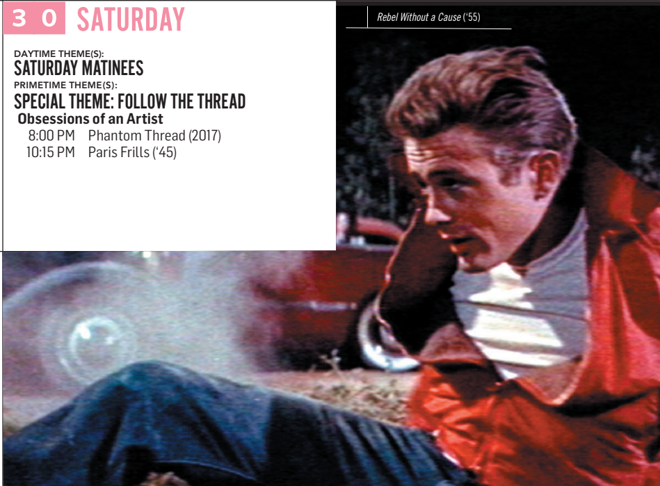
Rebel Without a Cause ('55)

PRIMETIME THEME(S): SPECIAL THEME: FOLLOW THE THREAD The Truth About Fashion 8:00 PM Bill Cunningham: New York (2010) 9:30 PM Paris is Burning ('90) 11:00 Cinema Through the Eye of Magnum (2017) F