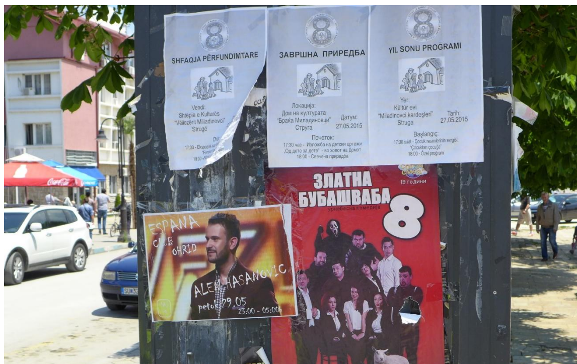
Photograph 2. Struga, east of the Drin River.