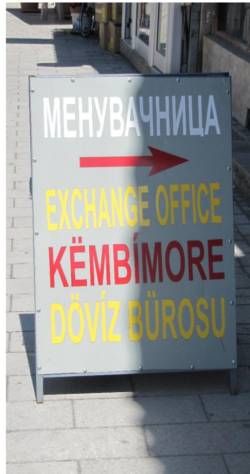
Ohrid, Goce Delčev Street.