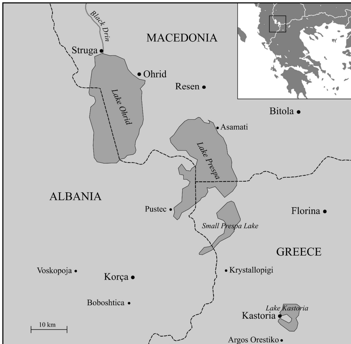
Locations visited by the members of HALS initiative in June 2015 around Lakes Ohrid and Prespa.

The participants in the Central Balkans field expedition of the Helsinki Area & Language Studies (HALS) initiative in June 2015 visited twelve villages, towns, and cities in the region surrounding Lakes Ohrid and Prespa. 1 More than 200, mainly multilingual, informants were interviewed in Albania, Greece, and Macedonia.