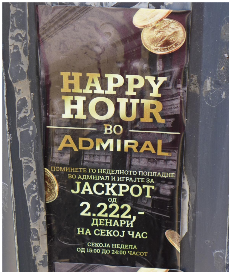
Photograph 1. Struga, east of the Drin River.