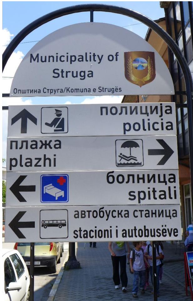
Struga, east of the Drin River.