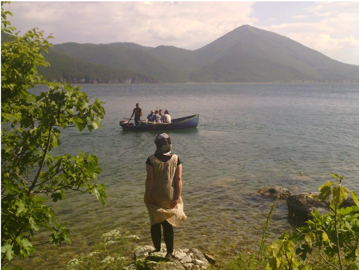
Above: Participants of the HALS field expedition together with locals in Asamati. Below: The Small Prespa Lake.