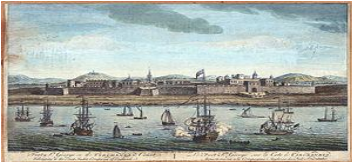
An 18th century portrait depicting Fort St. George, the first major British settlement in India and the foundation stone of Chennai.

According to the Archaeological Survey of India (ASI), Pallavaram was a megalithic cultural establishment, and pre-historic communities resided in the settlement. The Pallavas of Kanchi built the areas of Mahabalipuram and Pallavaram during the reign of Mahendravarman I. They also defeated several kingdoms including the Cheras, Cholas and Pandyas who ruled over the area before their arrival. Sculpted caves and paintings have been identified from that period. Ancient coins dating to around 500 BC have also been unearthed from the city and its surrounding areas. A portion of these findings belonged to the Vijayanagara Empire, which ruled the region during the medieval period.