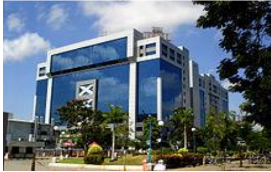
Tidel Park is billed as the largest IT Park in Asia.