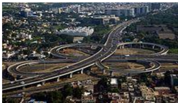
Cloverleaf interchange at Kathipara Junction

Chennai is one of the cities in India that is connected by the Golden Quadrilateral system of National Highways. It is connected to other Indian cities by four major National Highways (NH) that originate in the city. They are NH 4 to Mumbai (via Bangalore), NH 5 to Kolkata (via Bhubaneswar), NH 45 to Theni (via Tiruchirapalli) and NH 205 to Anantapur, Andhra Pradesh (via Tirupati). Chennai is connected to other parts of the state and the Union Territory of Pondicherry by state highways.