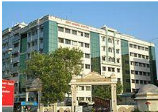
Government General Hospital

Chennai has world-class medical facilities, including both government-run and private hospitals. The government-aided hospitals include General Hospital, Adyar Cancer Institute, TB Sanatorium, and National Institute of Siddha. The National Institute of Siddha is one of the seven apex national-level educational institutions that promote excellence in Indian system of medicine and Ayurveda. Some of the popular private-run hospitals in Chennai are Apollo Hospitals, Chettinad Health City, MIOT Hospitals and Vasan Healthcare. The prime