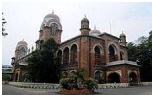
Madras University Senate House