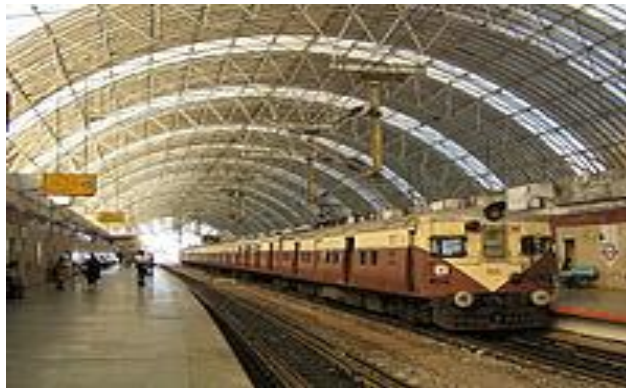
A railway station on the MRTS line

Chennai hosts the headquarters of the Southern Railway. The city has two main railway terminals. Chennai Central station, the city's largest, provides access to other major cities as well as many other smaller towns across India, whereas Chennai Egmore provides access to destinations primarily within Tamil Nadu; however, it also handles a few inter-state trains. The Chennai suburban railway network, one of the oldest in the country, facilitates transportation within the city. It consists of four broad gauge sectors terminating at two locations in the city, namely Chennai Central and Chennai Beach. While three sectors are operated on-grade, the fourth sector is majorly an elevated corridor, which links Chennai Beach