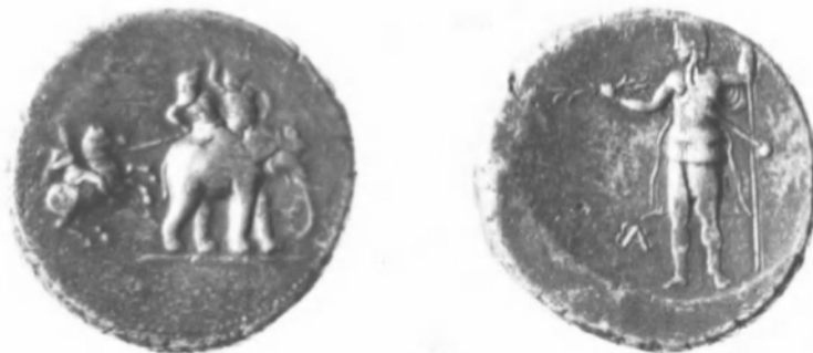
Fig. 1. Silver coin with the figure of Porus (BMC 191, 61).