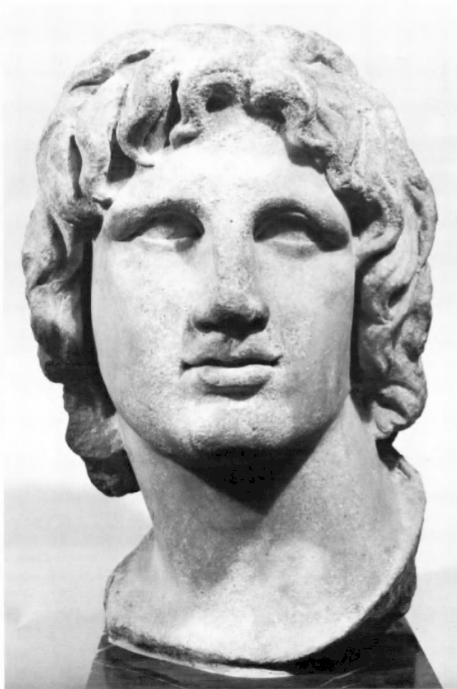
FIG. 2. Head of Alexander the Great. Sculpture.

it is strange that they did not insist on returning by the route they had come. Was this story of revolt concocted by the Greek historians to put all the blame on the soldiers and prove that Alexander wished to be a world conqueror but stopped at the limit of the Achaemenid