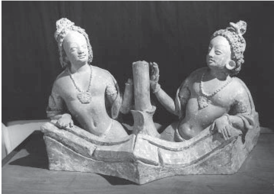
FIG. 11. Fundukistan. Two naga kings (seventh century). Musée Guimet, Paris.

and Skanda standing at the left side of his mother.’ 94 The group stands on a pedestal with two steps. On the upper step there is a three-line inscription in a transitional script between Brāhmī and Śāradā. It cites Shiva as Maheshvara. 95 Another fine example of Hindu art is a marble statue of Surya from Khair Khanah: