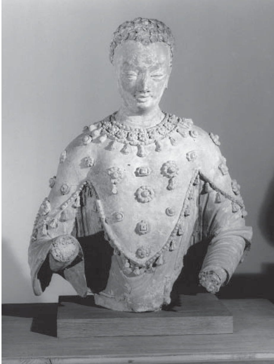
FIG. 12. Fundukistan. Dressed Buddha (seventh century). Musée Guimet, Paris.