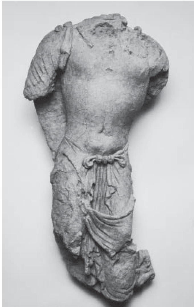
FIG. 6. Ajina-tepe. Torso of a Bodhisattva. Painted clay.

The art of Fundukistan is characterized by vivid colours, bold foreshortening and elegance: although it betrays a powerful Indian influence, there is also a certain similarity with the art of Ajina-tepe and Kala-i Kafirnigan (Figs. 11 and 12).