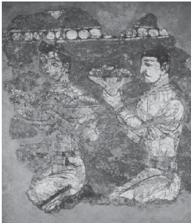
FIG. 5. Ajina-tepe. Mural painting.