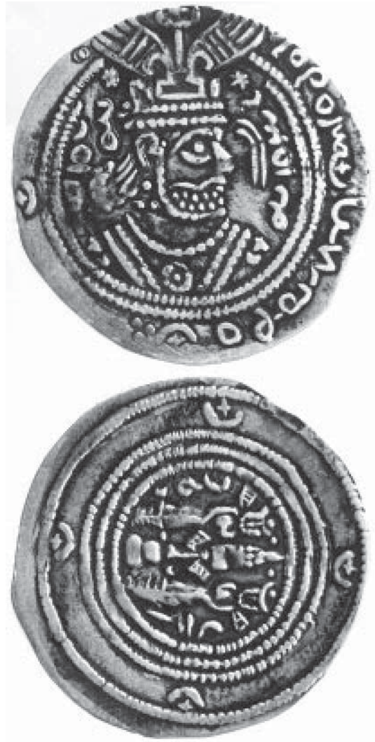
FIG. 1. Coin of Fromo Kesaro (obverse and reverse).

This is the latest issue of Fromo Kesaro known so far to have been minted in Hund (ancient Udabhandapura).