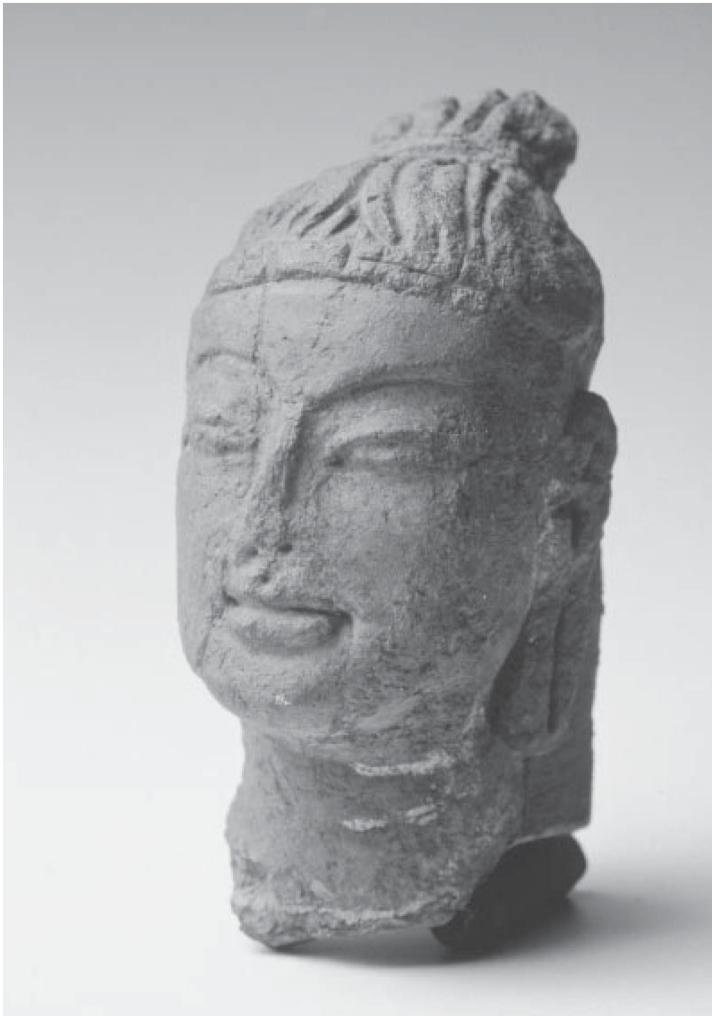
FIG. 8. Ajina-tepe. Head of a brahman. Painted clay.