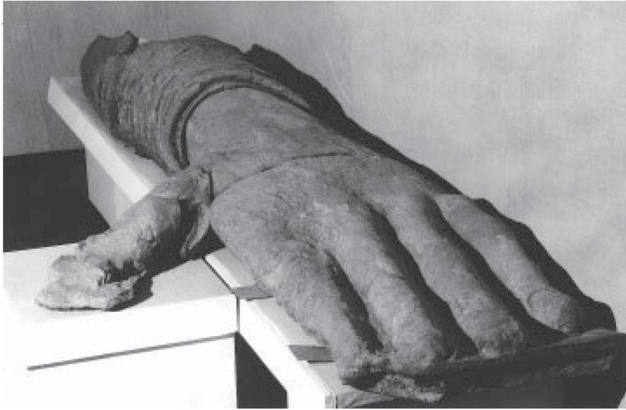
FIG. 4. Ajina-tepe. Hand of the 12-m statue of the Buddha in Nirvana.