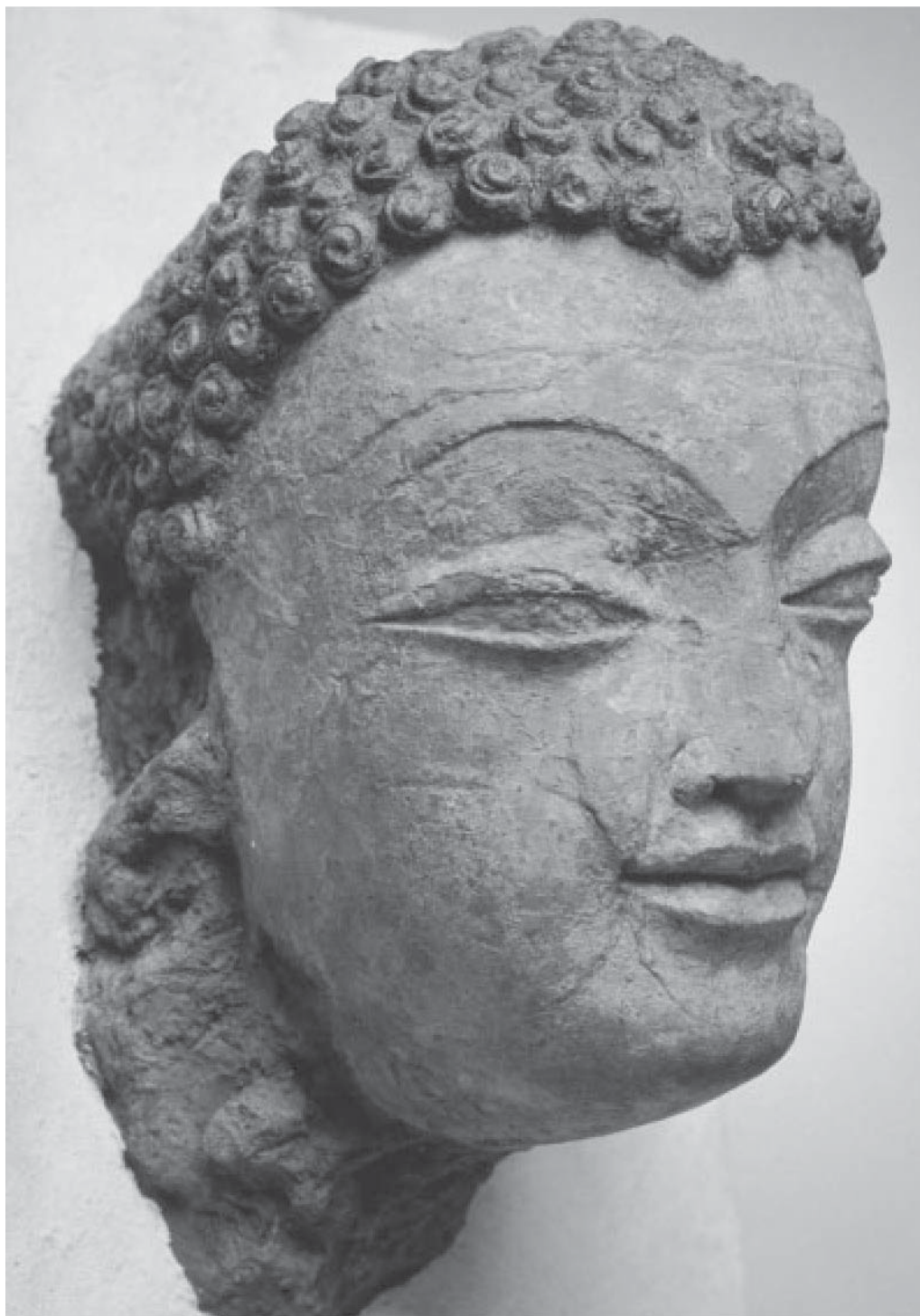
FIG. 7. Ajina-tepe. Head of a Buddha. Painted clay.