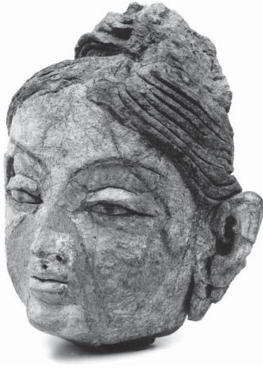
FIG. 9. Ajina-tepe. Head of a noblewoman. Painted clay.

thought that this shrine is linked with the upper classes of society. 92 The remains of a Hindu shrine have also been found in Chigha Saray (or Chaghan Sarai) in the Kunar valley, dating from the eighth or ninth century. 93