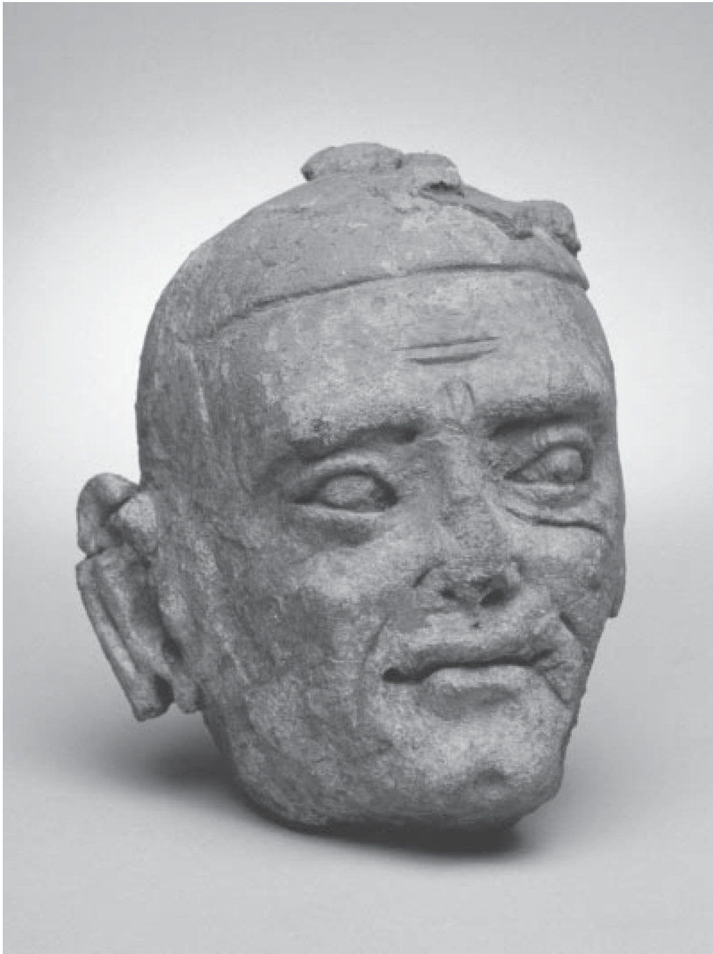
FIG. 10. Ajina-tepe. Head of a monk. Painted clay.