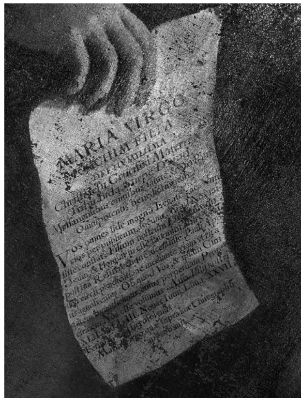
13 Mattia Preti, Madonna della Lettera (detail from Fig. 1, slightly rotated)

diante viam verita/tis agnoscentes. Ob quod Vos et ipsam Civi/tatem benedicimus, cuius perpetuam Prote/ctricem Nos esse volumus. Anno Filij nostri / XLII. Ind. .I. .III. Nonas Iunij Luna .XXVII. / Feria .V. Ex Hierosolymis. / Maria Virgo, quae supra hoc Chirographum / approbavit." The text corresponds to the Latin version published in 1556 by Francesco Maurolico, except for the final "approbavit", against