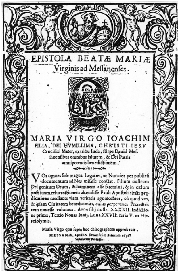
4 Broadsheet with the Epistola Beatæ Mariæ Virginis ad Messanenses , Messina 1636

The pro-inquisitor was referring to the fact that, as already mentioned, the Virgin's letter to the Messinese had been declared apocryphal – a judgment first expressed by the Sant'Uffizio in 1598. 25 This condemnation did not mention the images of the Madonna della Lettera, but exclusively the text of the letter, which