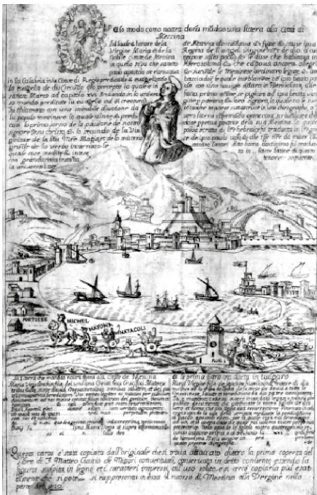
2 View of Messina , in: Spiegazioni di due antiche mazze di ferro ritrovate in Messina nell'anno MDCCXXXIII , Venice 1740, between pp. 168 and 169

re d'arte recuperate, ed. by Franca Campagna Cicala/Giovanni Molonia (= Quaderni dell'attività didattica del Museo Regionale di Messina , VIII [1998]), pp. 39, 133, no. 156.