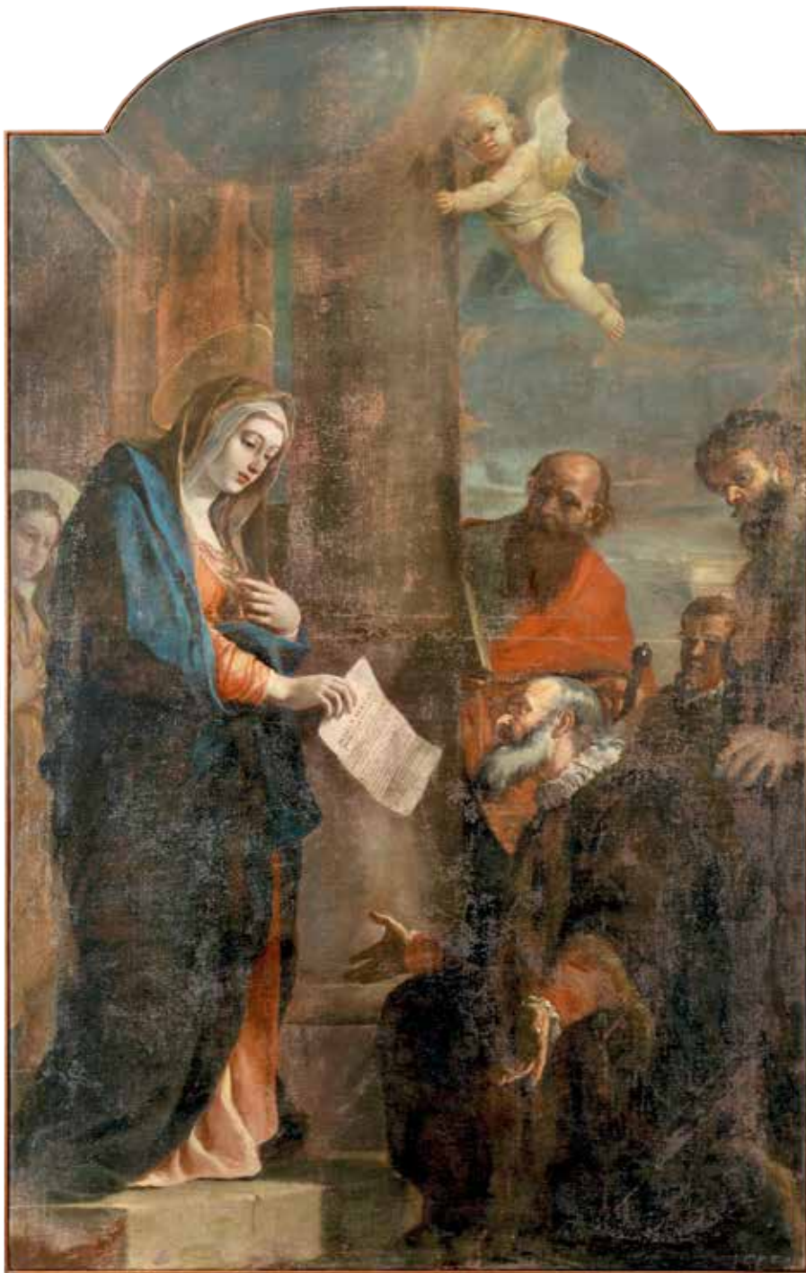
1 Mattia Preti, Madonna della Lettera or The Messinese embassy to the Virgin , 1664. Messina, Museo Regionale Interdisciplinare