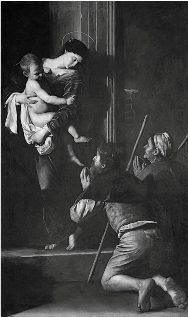
12 Caravaggio, Madonna of Loreto , 1604-1606. Rome, Sant'Agostino in Campo Marzio