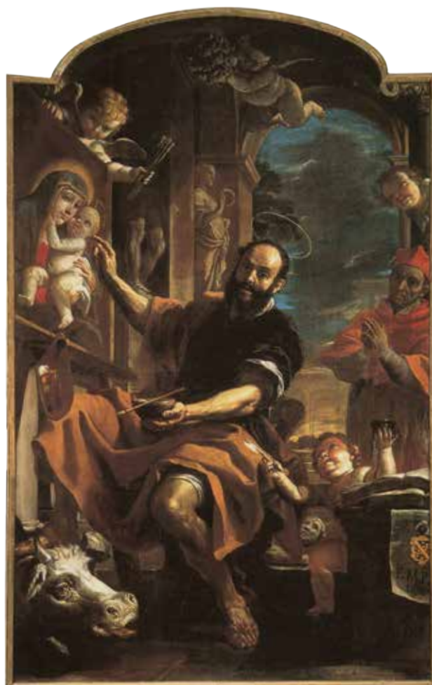
14 Mattia Preti, Saint Luke painting the Virgin , 1671. Valletta, Saint Francis of Assisi