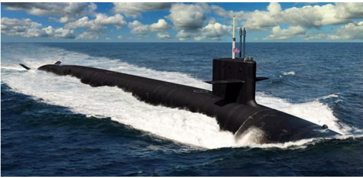
Figure 2. Columbia (SSBN-826) Class SSBN Artist's rendering

The Columbia-class design (see Figure 2 and Figure 3) includes 16 SLBM tubes, as opposed to 24 SLBM tubes (of which 20 are now used for SLBMs) on Ohio-class SSBNs. Although the Columbia-class design has fewer SLBM tubes than the Ohio-class design, it is larger than the Ohio-class design in terms of submerged displacement. The Columbia-class design, like the Ohio-class design before it, will be the largest submarine ever built by the United States.