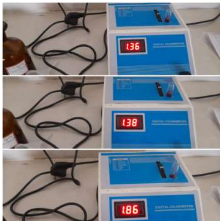
Figure 3 – Colorimeter Analysis of Kumkum Samples.