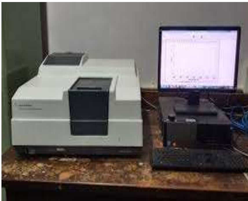
Figure 4 – UV Visible Spectroscopy Machine