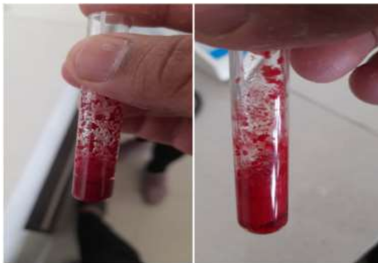
Figure 1 – Chemical Examination of Kumkum for Ion Detection