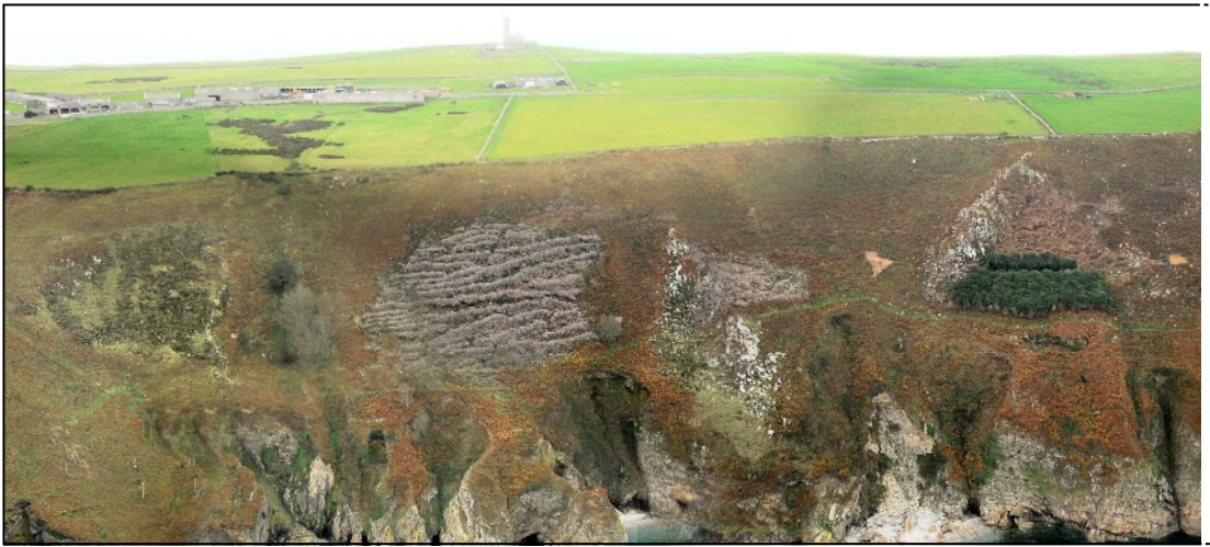
Plate 4 (above and opposite page, top): View of the Eastern Sidelands of Lundy in 2007 showing stacked lines of rhododendron brash from areas where rhododendron has been cut and areas of intact rhododendron, further north, still to be cut