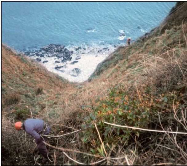
Plate 8: Professional climbers descending cliffs to cut rhododendron