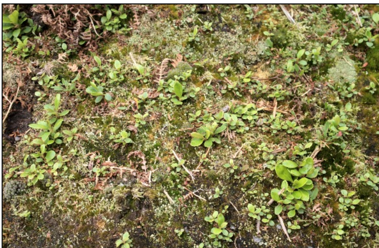
Plate 10: The densities of rhododendron seedlings that were present at the side of the path leading down to Quarry Bay.