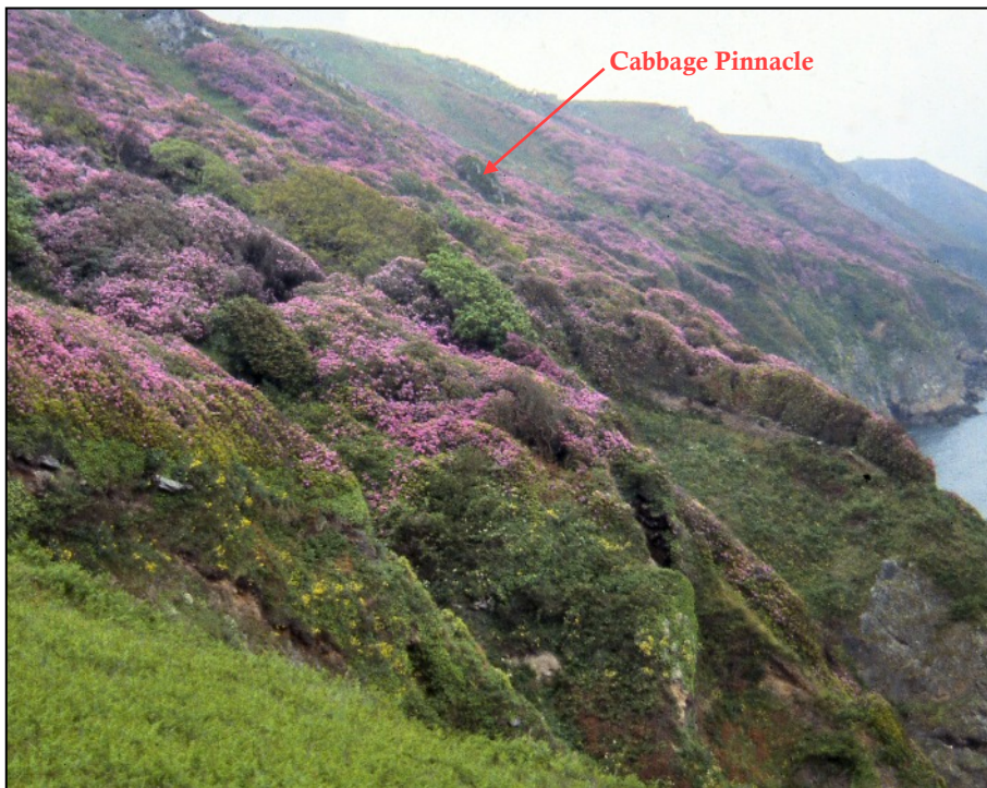
Plate 1: Eastern Sidelands of Lundy 1993 with rhododendron at its likely maximum extent. Note the rhododendron descending the cliffs beyond the flowering Lundy cabbage and the 'Cabbage's Last Stand' pinnacle surrounded by rhododendron.

Accenture group, BTCV, Callum Rankine and BMC, Lundy Field Society, National Trust, the other work parties for which we have no records.