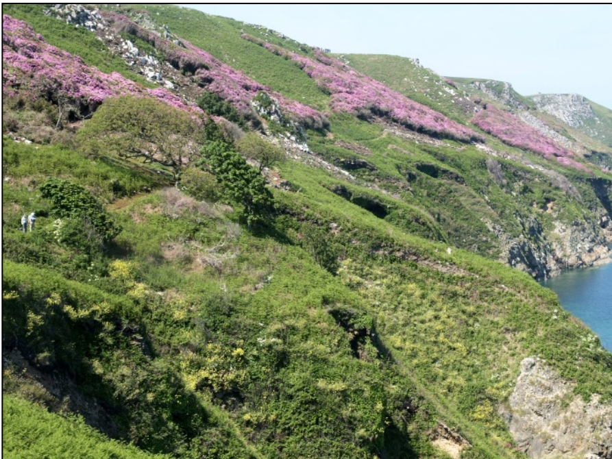
Plate 3: Eastern Sidelands of Lundy 2006. Rhododendron growing between the lower eastside path and the cliff edge has all been cut, except in the most northerly patch.