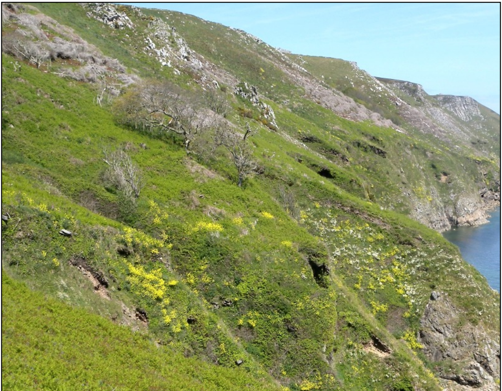
Plate 5: Eastern Sidelands of Lundy 2013. All major rhododendron blocks cut.