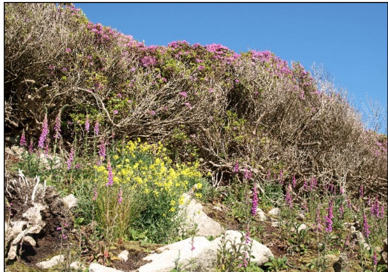
Plate 9: Lundy cabbage and foxgloves flowering in an area previously cleared of rhododendron (June 2009). This ‘garden’ effect is brief, with rapid succession to a grass sward and bracken.