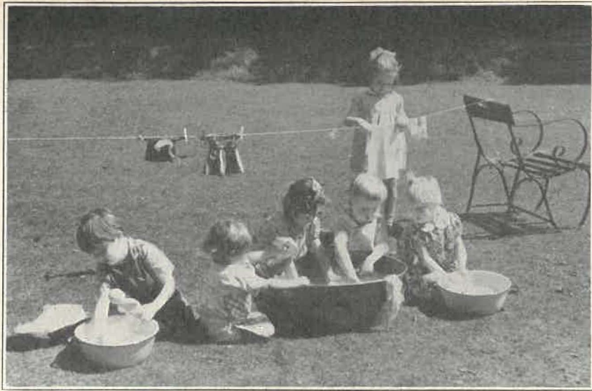
AT THE LIVING CHURCH NURSERY SHELTER: "This is the way we wash our clothes," sing the "under 5's" whose happy child life has been made possible by the generosity of THE LIVING CHURCH FAMILY. Above, six of the children are shown learning in play habits that will later stand them in good stead.