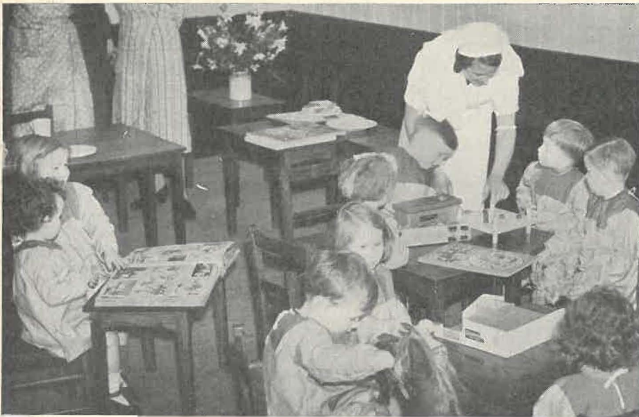
NURSERY SHELTER CHILDREN: In the accompanying article the happy daily life of the children at Barton Place is described. Almost $1,000 remains to be raised for the year's support. THE LIVING CHURCH FAMILY are asked to send their contributions as soon as possible to assure the campaign's success.

W.V.S. members in the district must feel very glad that they are in contact with the nurseries. If I were resident in the locality I am sure I should want to take part in the "odd jobs" for with the nursery work you do feel that however small the task you are asked to do, you are helping in day-to-day constructive work of building up self-reliant healthy citizens for tomorrow's world.