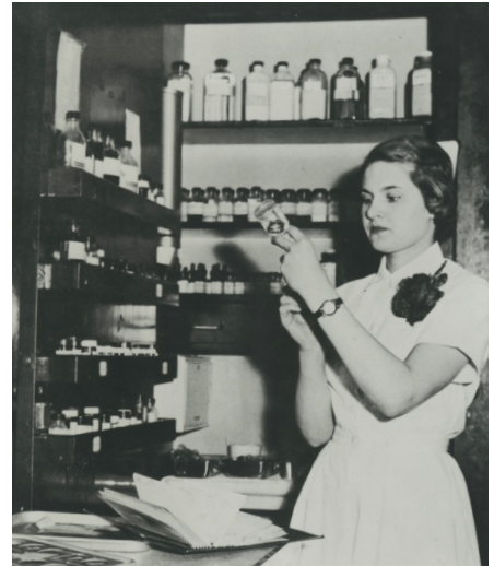
1958 Nursing senior preparing medication.