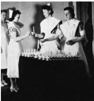
1943 Capping ceremonies were held to mark the end of the nursing students' probationary period. The ceremony was considered a highly meaningful transition into the nursing profession.