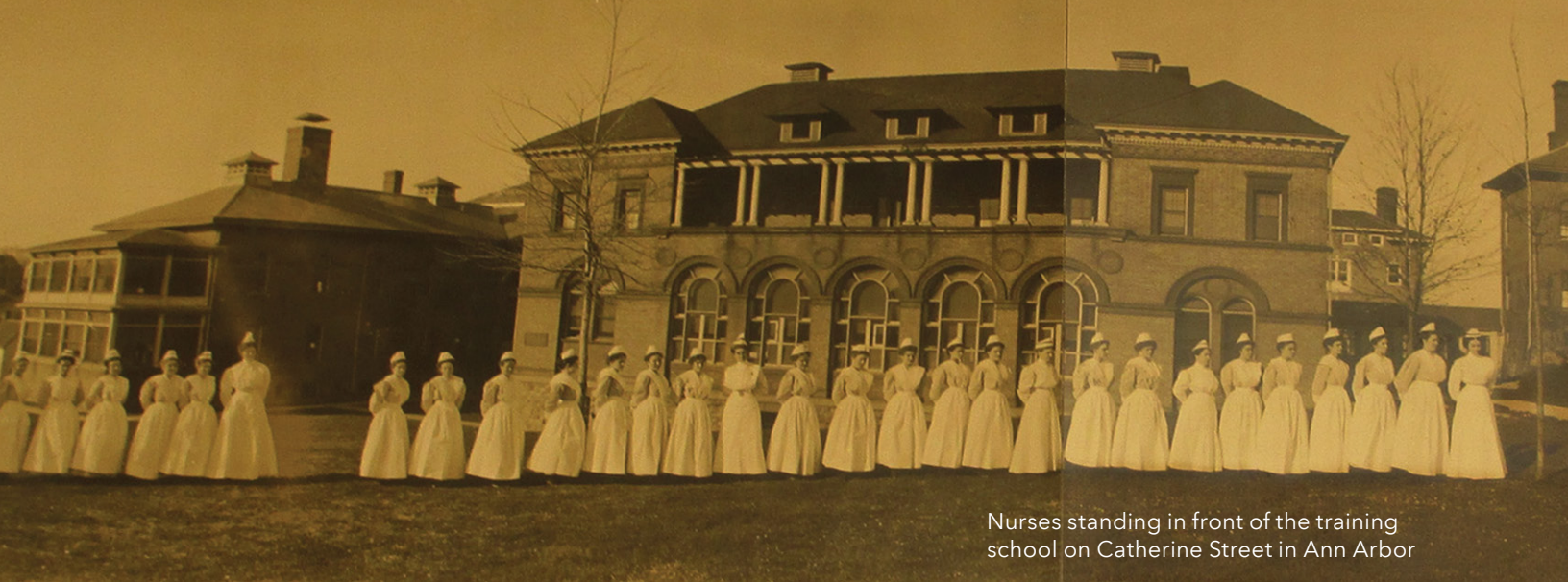
Nurses standing in front of the training school on Catherine Street in Ann Arbor