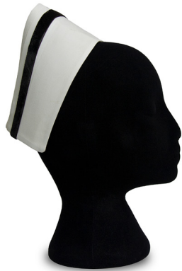
Late 1960s Nursing cap.