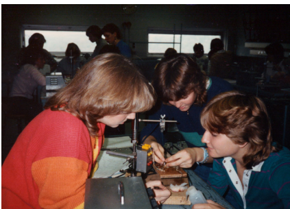
1985 Nursing students conduct an experiment in their physiology lab. The experiment focused on muscles and the strength of their contractions.