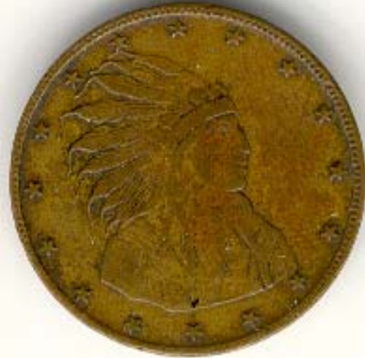
Jefferson Park National Bank Promotional Coin