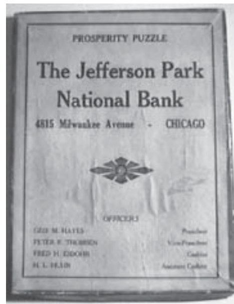
The Jefferson Park National Bank Promotional Puzzle