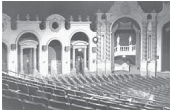
Interior of the Gateway Theater