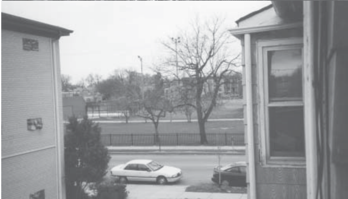
Top photo taken by Curt Hinsch sometime before 1930. It shows two houses on the south side of Higgins in the park. The houses were moved or torn down to make way for the park. Bottom photo taken in 1990 by Ed Hinsch Photos Courtesy of Ed Hinsch