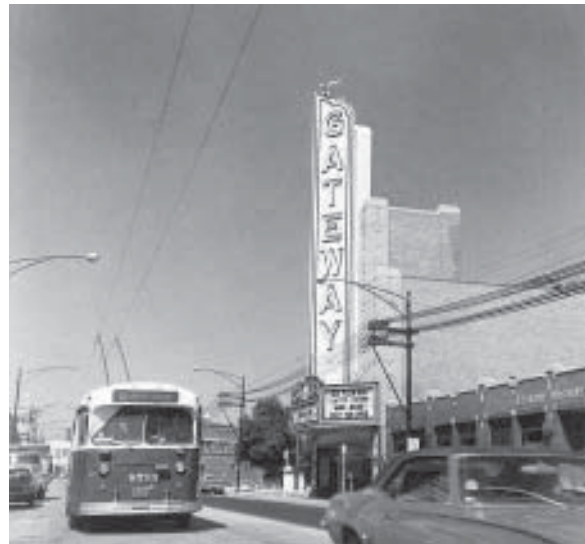
The art deco facade and marquee of the Gateway Theater. Photo from mid 60's.

The Plitt Theater group owned the Gateway for a short while until it was sold to the Copernicus Foundation in 1985. Although the Copernicus Foundation changed the outside of the theater, the interior has been restored. At the right side of the massive screen with velour curtains sits the Red Wurlitzer Grand Pipe Organ. The original was removed in the 1960's and the current one installed in 1983. The Grand Pipe Organ has over twelve hundred pipes, some over 15 feet high! The organ has many sound capabilities. Sleigh bells, cow bell, wind chimes, Chinese gong, bird whistle, siren, car horn and thunder are a few of the sounds that give "voice" to the silent pictures that are shown here each summer.