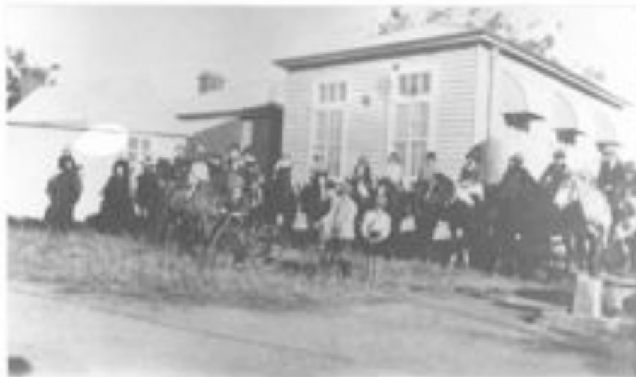
Figure 5. Gum Flat Public School (1883) in 1929 with curved sun hoods to west-facing windows.

The layout of the long schoolrooms constrained the placement of windows and forced Kemp to locate them at the back of the room behind the pupils. Moreover, orientation of school buildings for the most favourable lighting conditions to protect pupils' eyes was a particular problem on small sites and in the depression years of the 1890s when only the front face of the building was built of a quality fit to address the street. At Young Public School, the large windows on the western side provided plenty of light but resulted in a 'blaze of sunlight from the windows in the teachers' eyes and great heat affecting all therefrom'. 73 At the little country school of Gum Flat (1883), curved sun hoods were placed to create artificial shade over the west-facing windows but it is not known whether these were specified by Kemp or added by the district inspector and local builder (Fig 5). 74