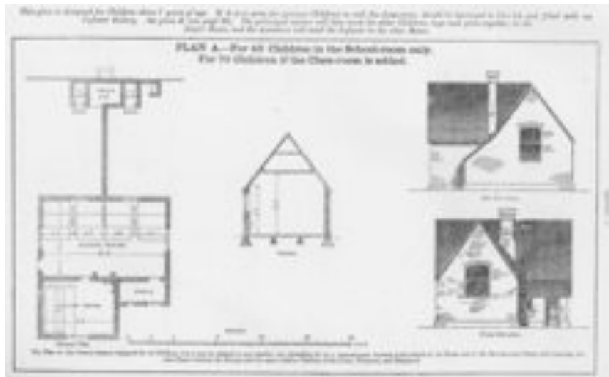
Figure 1. British Council of Education Plan A.