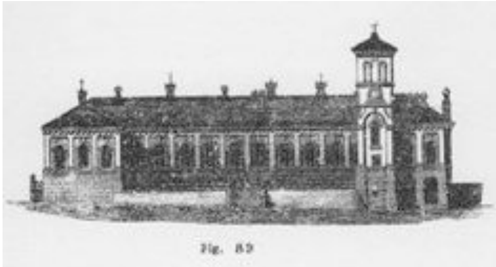
Figure 6. Irish Board of Education school suggested as a model for New South Wales schools by Combes.

'Grand Classic' 88 schools has previously been thought to have been influenced by these buildings and their suitability for the Australian climate. 89 However, in Hammet's terms, a 'new element of the story' has emerged. A plan and elevation of a typical school of the Irish National Board of Education, published in Combes's report and hitherto unnoticed, may also have influenced Kemp's architectural style, being similar in style (Fig 6).