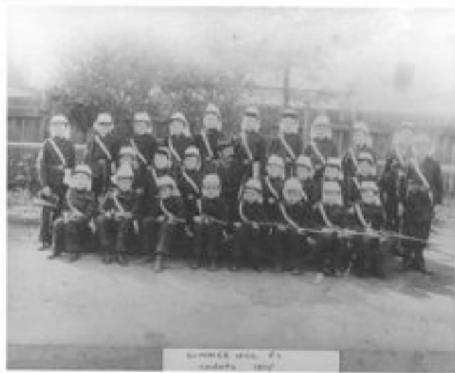
Figure 4. Cadets at Summer Hill Public School (1883) in 1895.

Marching drill had been introduced as a disciplinary aid in the national schools around 1867 45 and in 1871 it spawned a system of patriotic military drill at four of the largest Sydney schools under Sergeant-major Mulholland. It was intended to 'drill the boys with rifles and when a sufficient number provide themselves with uniforms, to form a cadet corps.' 46 By 1884 cadet corps were well established in many New South Wales schools (Fig 4) and W. J. Trickett, Minister for Public Instruction, inspected the combined public schools cadet corps at the Paddington Barracks. 47