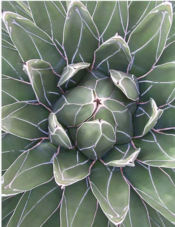
Fig. 6 Agave victoriae-reginae in cultivation at about 20 years old, showing the wonderful symmetry of this iconic species