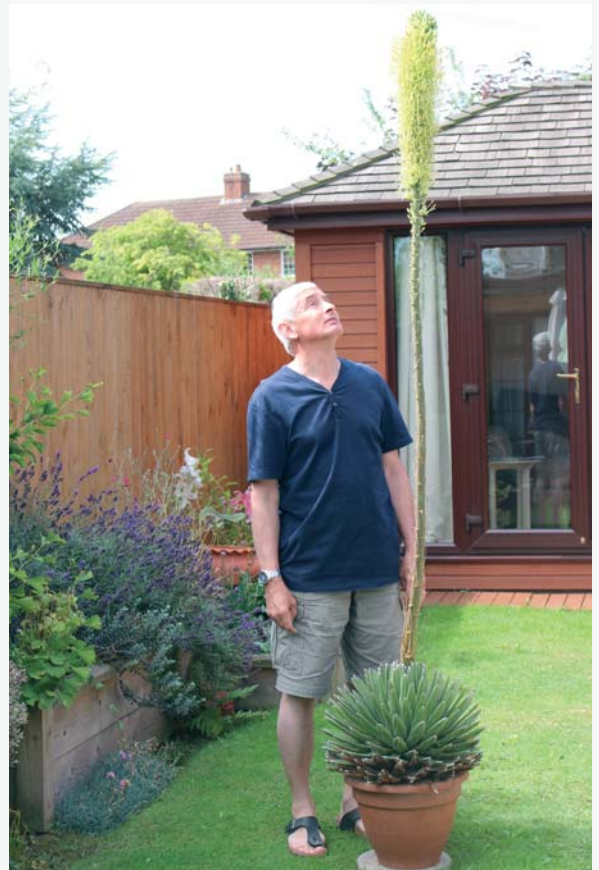
Fig. 12 (right) For scale, the author with A. victoriae-reginae on 16 August 2015

Fig. 11 The peak flowering of A. victoriae-reginae on 13 August 2015