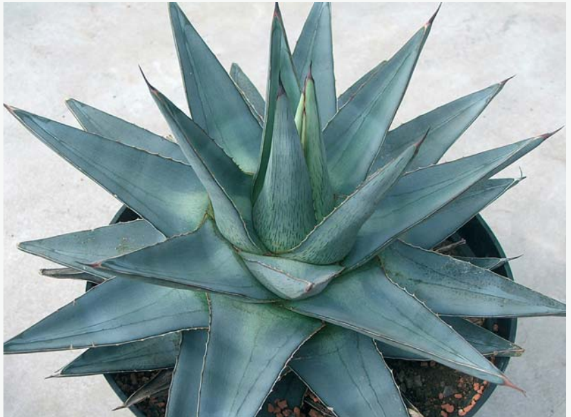
Fig. 18 Agave ‘Pumila’ ( Agave lechuguilla × nickelsiae ), photographed in the reserve collection at Kew