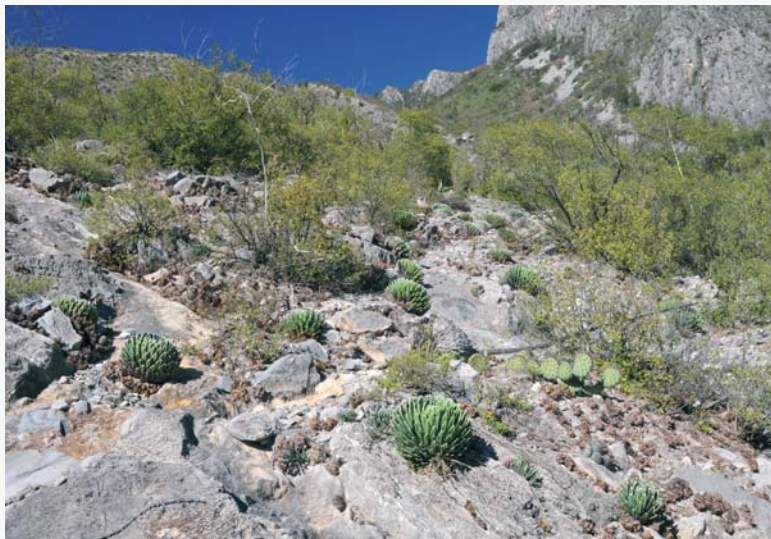
Fig. 2 Agave victoriae-reginae in habitat in the Cañon el Potrerrito (the Potrerrito Canyon), Nuevo León, Mexico, growing in association with opuntias