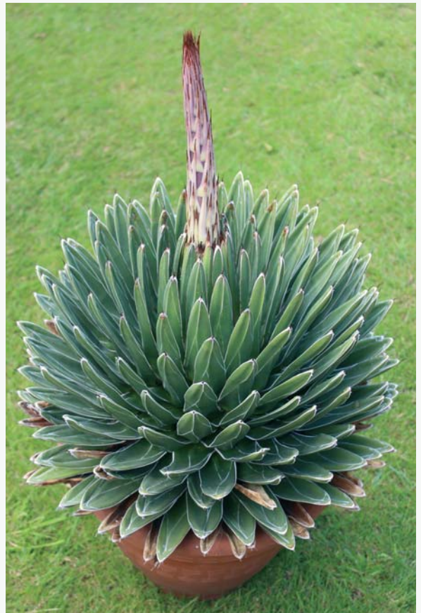
Fig. 8 (right) The start of flowering of my 30 year old specimen of A. victoriae-reginae on 16 May 2015