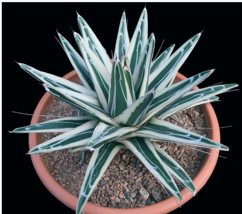
Fig. 14 Agave victoriae-reginae 'Hyon Zan'.

A recent trend in Agave cultivation has been the appearance of a wide range of variegates of the smaller-growing species: a good range of these is illustrated by Pilbeam (2013) in his attractively illustrated Gallery of Agaves . Many of these have been produced and propagated in Asia, are attached to names that are often difficult to spell or pronounce, and also often come with hefty price tags! A prime target for the production of attractive variegates has of course been A. victoriae-reginae . Two of these cultivars are illustrated here. 'Kizan' (Fig. 13) has attractive yellow-edging to the otherwise green central leaves. Even more stunning is 'Hyon Zan' (Fig. 14) with white striped marginal variegation. These are just two examples of the newly produced cultivars; the meaning of their