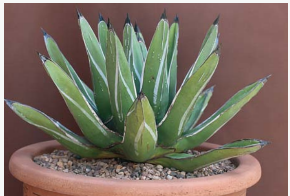
Fig. 17 Agave nickelsiae . For scale, the plant is about 35cm diameter in a 29cm diameter pot

To enable comparison of the two species, plants of each are shown in Figs. 15 & 16, whilst a single specimen of A. nickelsiae is also shown in Fig. 17. As indicated in Nickel's catalogue (Nickels, c. 1894) this species is distinguished from A. victoriae-reginae by having fewer more bulky leaves, up to 9cm wide at the base, triangular in cross section and up to 20cm long in a large specimen. It has prominent chalky