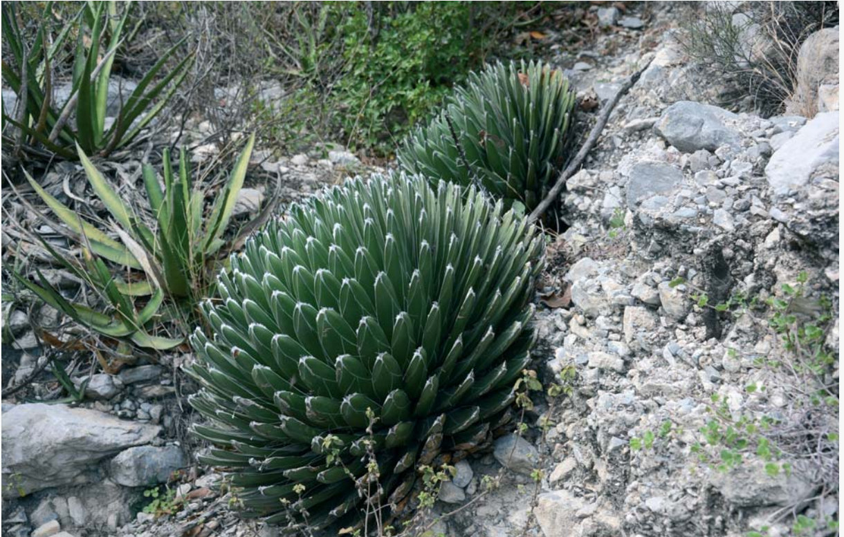
Fig. 4 Agave victoriae-reginae in habitat in the Cañon de la Huasteca (the Huasteca Canyon), Nuevo León, Mexico, growing in association with another unidentified Agave sp.

improve their appearance. Starr (2012) describes A. victoriae-reginae as, “a Chihuahuan Desert species found in a few yet widely separated localities”. It has a reasonably widespread distribution, occurring in the Mexican states of Coahuila, Durango and Nuevo León (Gentry, 1982; Starr, 2012). It is illustrated here in habitat at two locations fairly close together in the State of Nuevo León (Figs. 2–5). Of these, its most famous location is in the Huasteca Canyon (Figs. 4–5) where it occurs “by the tens of thousands”.