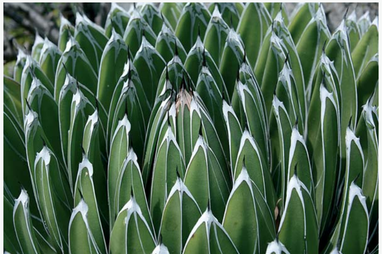
Fig. 5 Close up view of a single rosette of A. victoriae-reginae in the Cañon de la Huasteca

Agave victoriae-reginae easily justifies its popularity, being probably the most common Agave grown for its architectural good looks (Figs. 6–8), as opposed to Agave sisalana and A. tequilana that are raised commercially in vast numbers for the production of