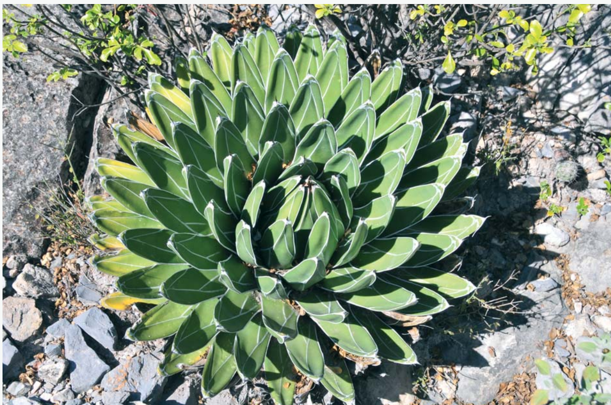
Fig. 3 Close up view of a single rosette of A. victoriae-reginae in the Cañon el Potrerrito.

In habitat this species is as stunningly beautiful as it is in cultivation, a feature that is not always the case, since many succulents look rather ragged in the wild, whereas in contrast careful cultivation can greatly