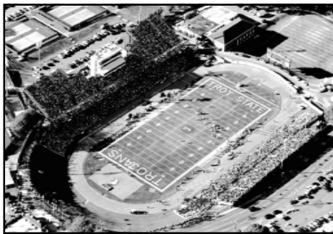
Richard M. Scrusby Field