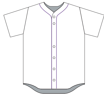
White (Required Away)