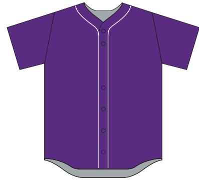
Purple (Required Home)

NOTE: Purple and white are required primary home/away uniforms for each UNA sport; Alternate uniform colors may be black, gray or UNA gold