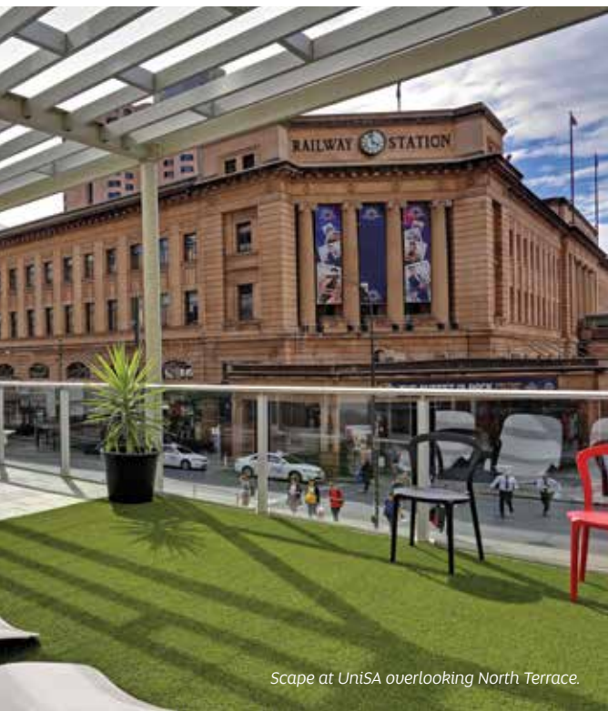
Scape at UniSA overlooking North Terrace.