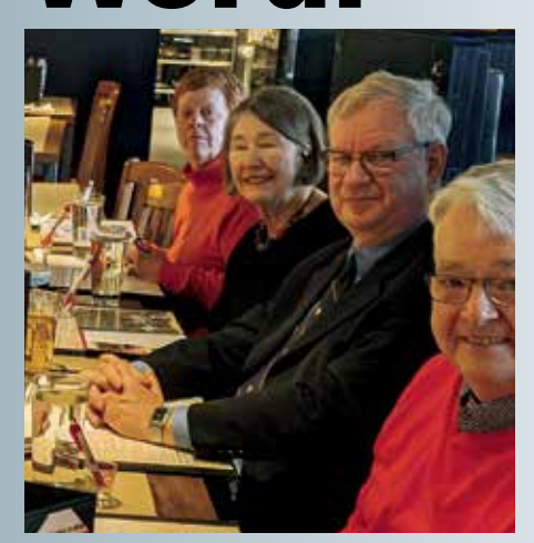
Meeting and Greeting Alumni in Toronto.