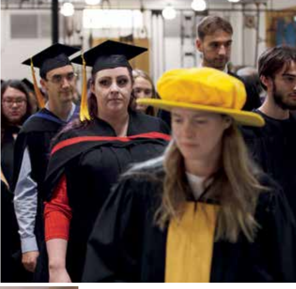
Led by the Esquire Bedells the procession into the Chapel begins.