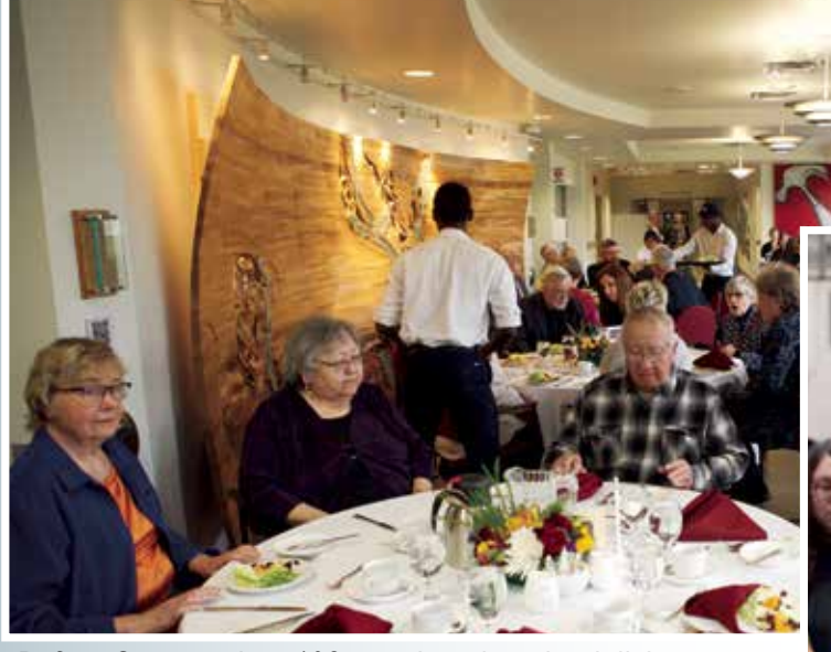
Before Convocation, 108 people enjoyed a delicious lunch in the Galleria.