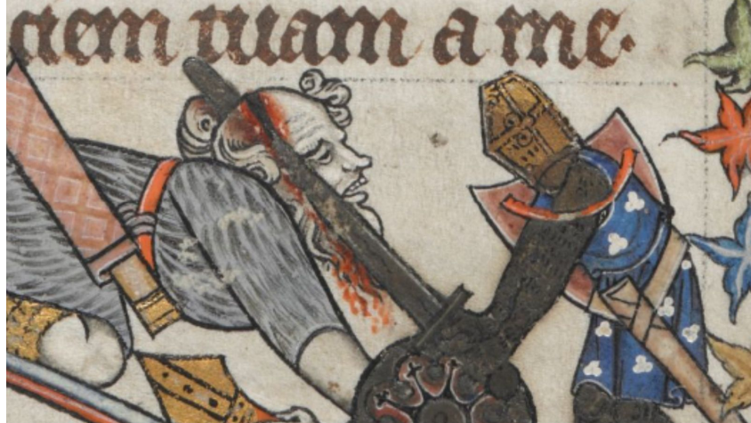
Depiction of Oakeshott Type XIII from the Tenison (Alphonso) psalter.

Image: File:Depiction of Oakeshott Type XIII from the Tenison (Alphonso) psalter.png, The Alphonso Psalter, CE 1284, CC BY-SA 4.0, via Wikimedia Commons.