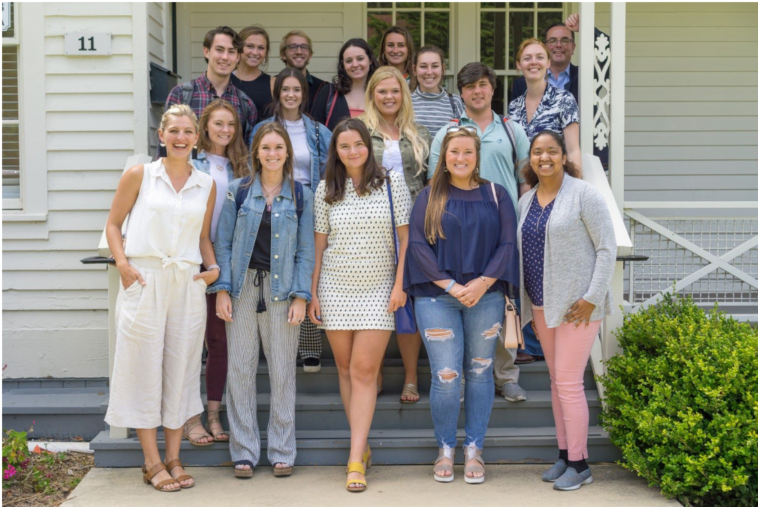
Ole Miss students visiting Wiki Education in July. During their visit, the students learned what it means to work for a mission-driven non-profit in the San Francisco Bay Area.