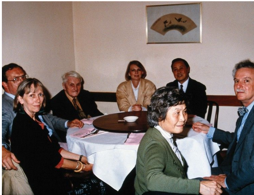
Joseph Needham with Chinese History and Sciences scholars, 1988.