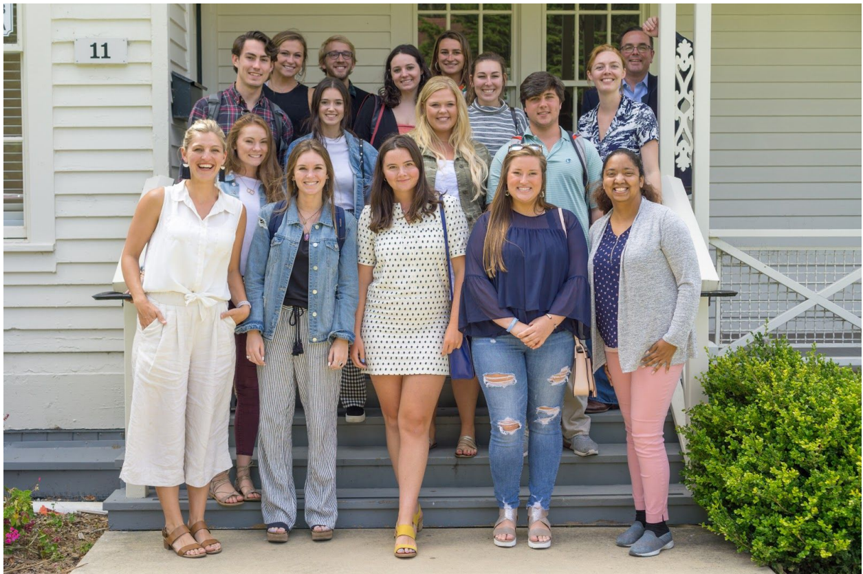
Ole Miss students visiting Wiki Education in July.