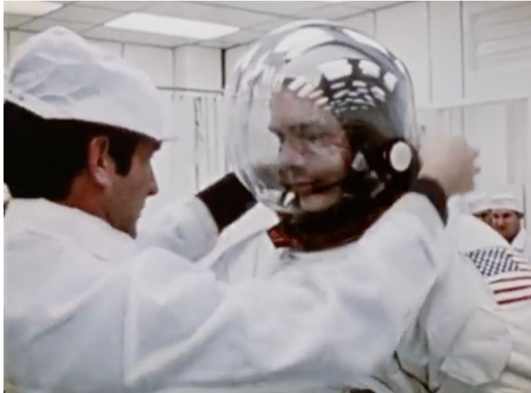
Dave Scott in space suit.

There were also some great photos that Visiting Scholars uploaded to Commons this month.