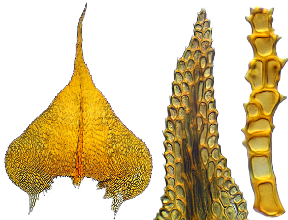
stem leaf outline, stem leaf apex, and paraphyllium 0.25 mm (left), 50 \mu\text{m} , 10 \mu\text{m}