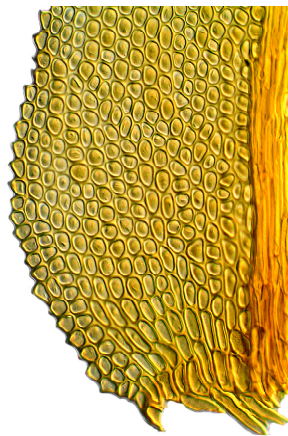
leaf basal angle 50 \mu\text{m}