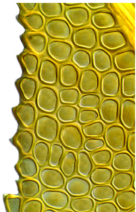
margin upper leaf 10 \mu\text{m}