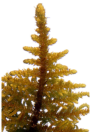
vegetative shoot 5 mm