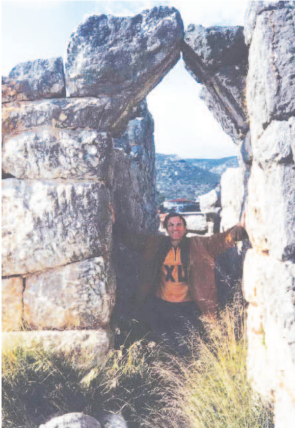
Fig. 2. The entrance of the Hellinikon pyramid with the eastern side. The entrance is next to the SE corner. The width of the entrance is 1.35 m, while its top consists of two converging stones that form a large capital Greek letter \Lambda .

AD) is from the first decade of 19 th century. William Martin Leake toured Peloponnese in 1806, when Greece was still under the Ottoman rule, and he mentions the Hellinikon pyramid, which he visited on March 14, 1806, in his book Travels on the Moréa (vol. II, pp. 340, 344). In it, he gives two drawings, front view and top view of the buildings.