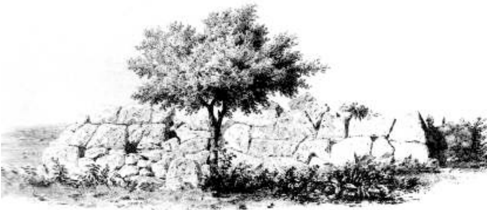
Fig. 6. The Ligourio pyramid, as imaged by the French Scientific Mission in Moreas (Expedition Scientifique de Morée, 1831).

Nevertheless, most researchers date the Ligourio pyramid along with the Hellinikon pyramid, around the 4 th century BC.