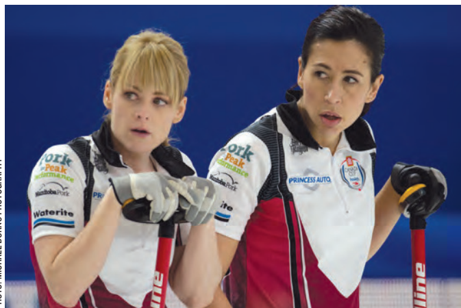
Dawn McEwen (left) and Jill Officer are two-time winners of the World Women's Curling Championship. They won their titles, playing front end for Team Canada's Jennifer Jones, in 2008 and 2018.