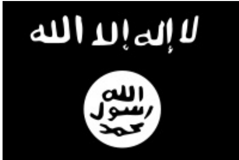
Flag of the armed Islamists of Ansar Dine

In early July, the MNLA declared publicly that it was prepared to help in regaining the North from its former Islamist allies.