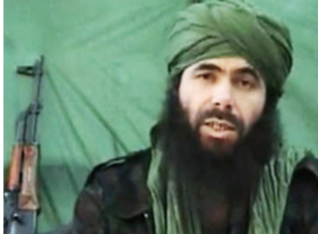
Mokhtar Belmokhtar also known as « The one-eyed man », one of the leaders of AQIM.

The organisation was put on the official terrorist organizations list of the United States, France and even Russia. It is considered by the U.N. to have close ties with Al-Qaeda and as such is denounced by the United Nations Security Council. 11