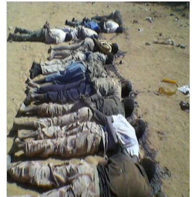
Malian soldiers executed in Aguelhok on 24 January 2012 by the rebels

So according to the different testimonies and an on-site investigation mission, 153 Malian soldiers prisoners of war were executed on that morning of 24 January 2012 by the attackers at about 10 o'clock in the morning. Some even had their throats slit, others were executed with a bullet. Taking civilian hostages and the summary execution of prisoners of war constitute serious breaches of international humanitarian law, in particular of Article 3 common to the Geneva Conventions and under the terms of Section 8.2.c) on war crimes in the Rome Statute of the International Criminal Court.