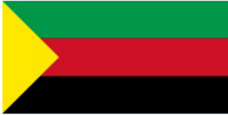
Flag of the MNLA and of Azawad

The National Movement for the Liberation of Azawad (MNLA in French) , a politico-armed group, is a carry-over from the surviving Tuareg rebellions of the 1990’s (1990-95) and 2000’s (2006). Formerly known as the National Movement for Azawad (MNA in French) 6 , it became the National Movement for the Liberation of Azawad (MNLA) on October 16, 2011, when it merged with the Northern Mali