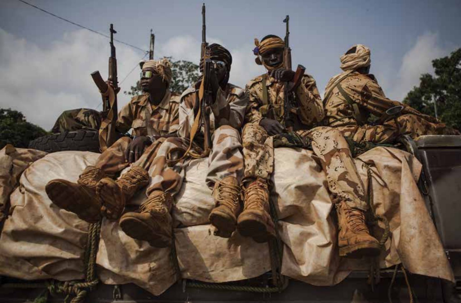
Soldiers in the Chadian national army (ANT) protecting a convoy of refugees in Bangui, February 2014

and mortally wounding a 39-year old Congolese soldier who had been assigned there as a police officer.