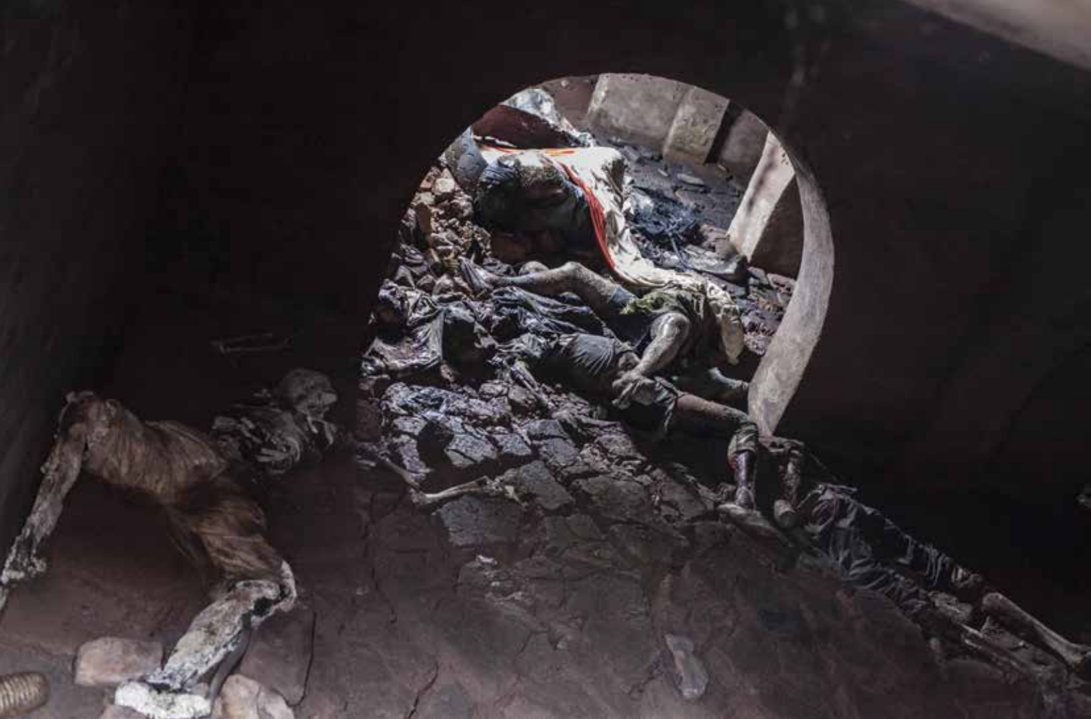
The mass grave at Camp Béal in Bangui discovered on 13 February 2014

No other armed group would have been able to enter the vicinity to carry out such violence or hide these bodies. Witnesses report seeing the Seleka's black 4X4 vehicles go back and forth to Panther Hill where six more bodies were found a few days later.