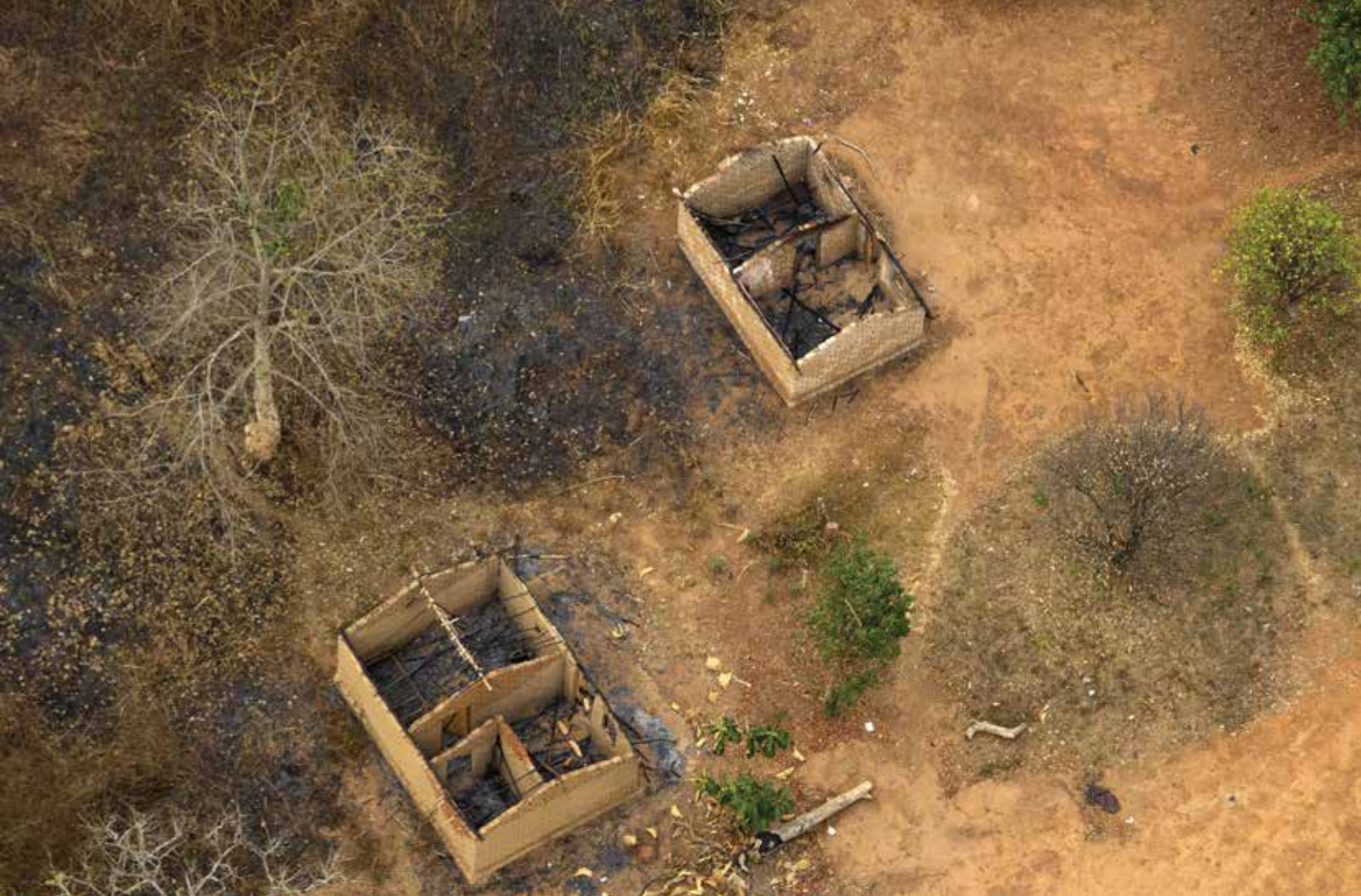
Homes destroyed during fighting. In the last year, thousands of homes have been destroyed.