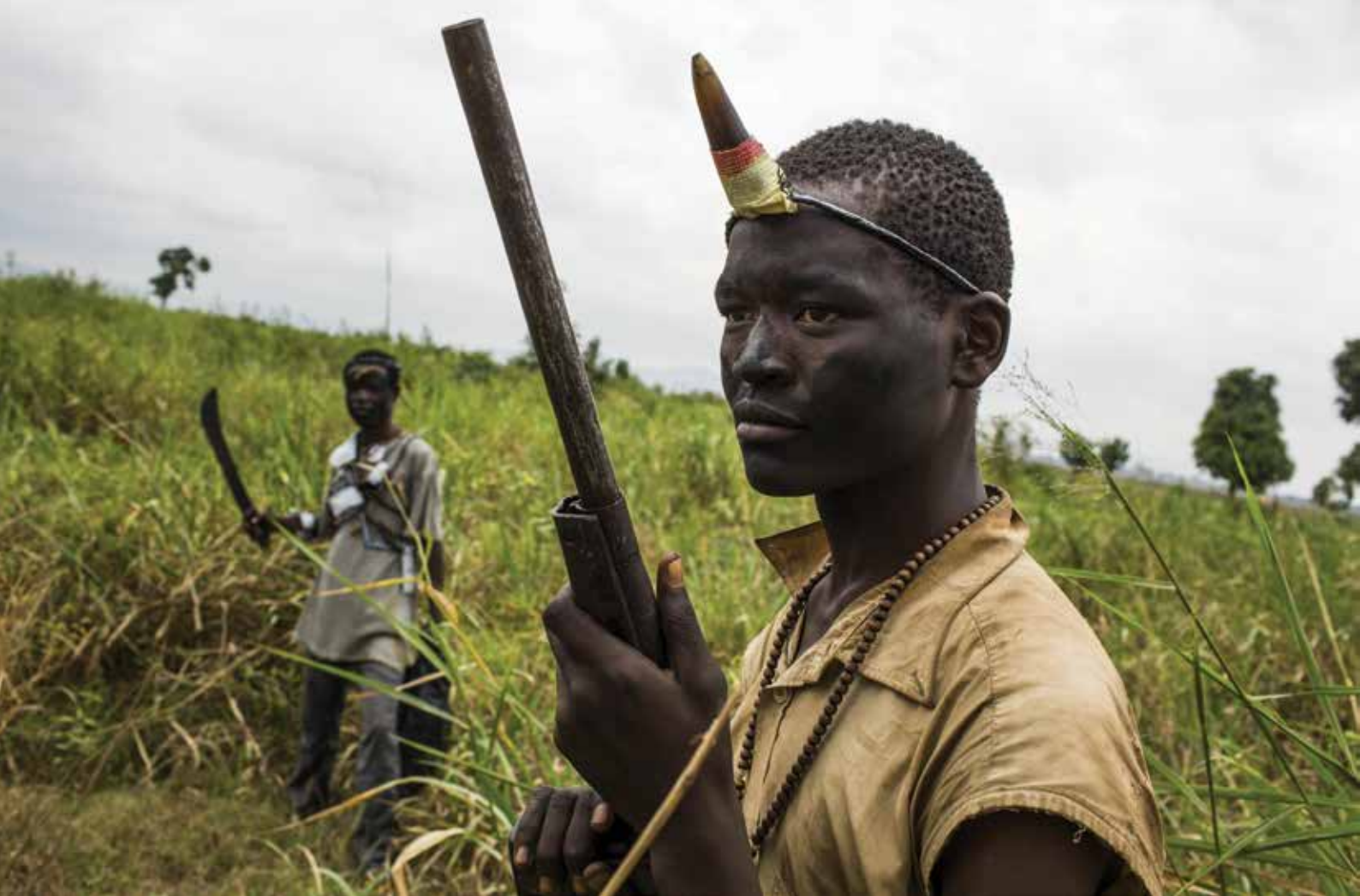
Anti-balaka fighters

military strategy because that was new to them. They also had to be taught how to become less violent. I told them that they shouldn't touch the Fulani and the Muslims who were born here”.