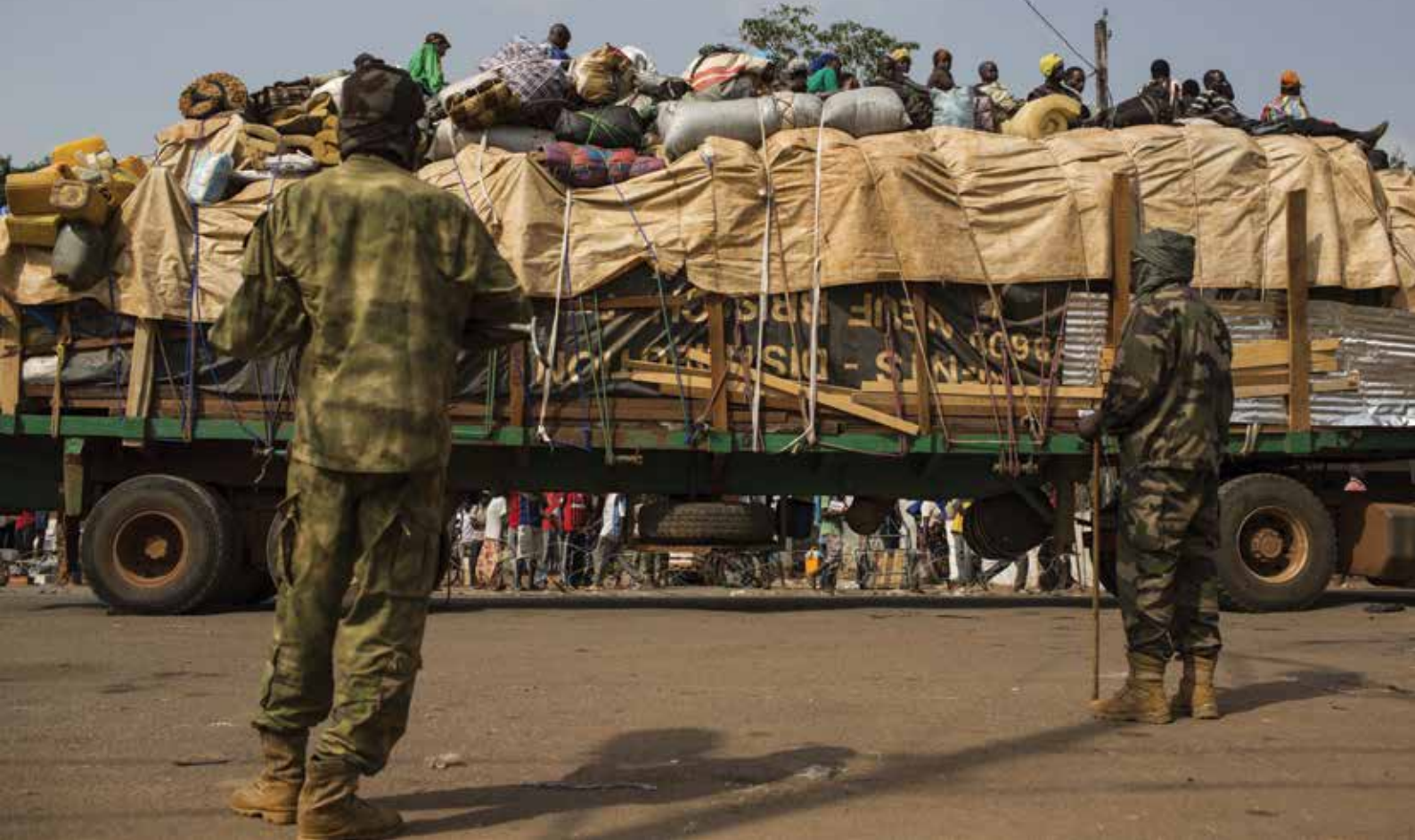
Convoy of Muslims leaving Bangui on 7 February 2013

This combination of factors is capable of triggering the same effects as the worst premeditated crimes.