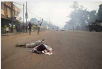
On cover: © REUTERS-SIEGFRIED MODOLA