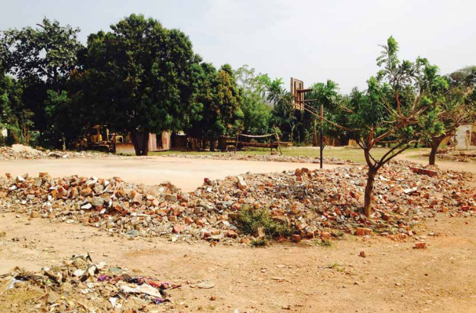
Location of a mosque that was “destroyed” and “replaced” by a basketball court in Bangui Fouh District, February 2014