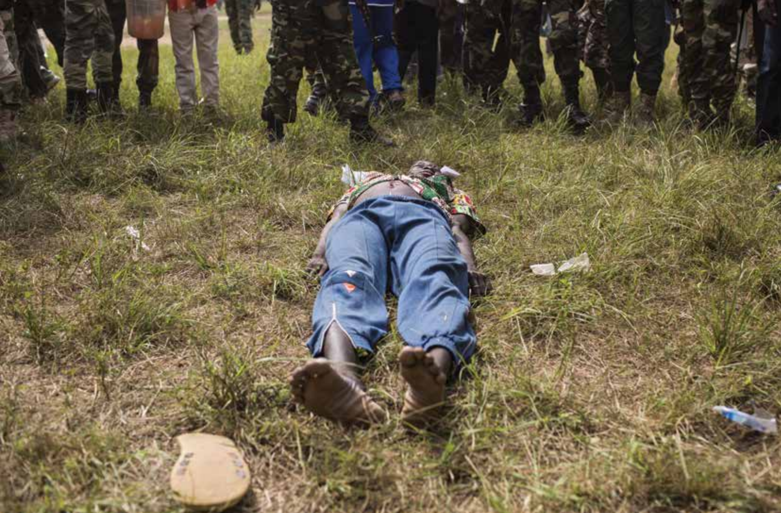
A man accused of being Seleka killed by the FACA at ENAM/Bangui on February 5, 2014. Some minutes later his body was dismembered and burned.

to do so requires political will and coherence. We cannot advocate reconciliation with people with blood on their hands and, at the same time, pretend that we want to fight impunity.”