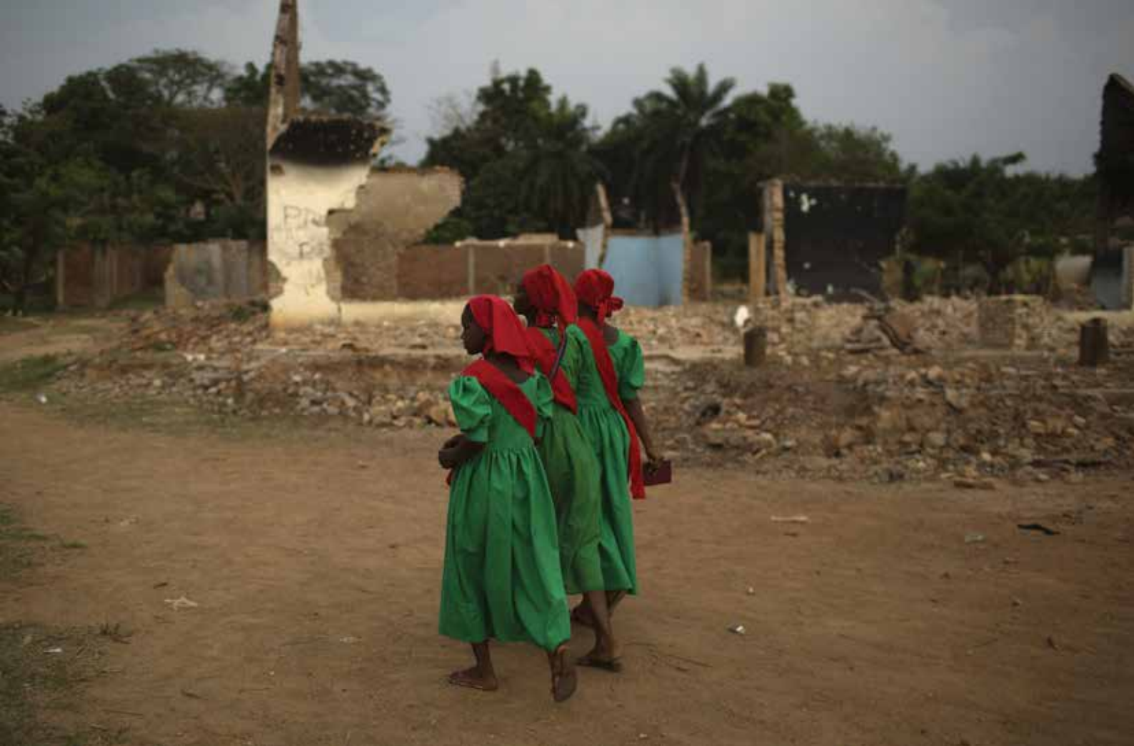
In front of the destroyed Islamic cultural centre, Bangui Fouh district