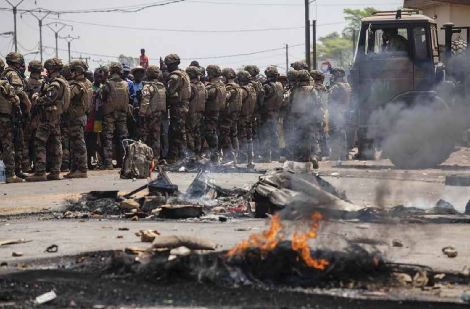
Sangaris soldiers protect the PK12 neighbourhood invaded by pro-anti-balaka demonstrators in Bangui on 13 February 2014

On 26 February 2014, the Central African Red Cross (CRC) said that it had recovered 11 bodies in the PK5 neighbourhood following violence that occurred there the preceding night. Some of the bodies had been badly mutilated. On 25 February 2014, the Red Cross counted nine fatalities and 10 persons injured during violent fighting and shooting taking place throughout the course of that day. The crossfire continued throughout part of the night, and during the day of 26 February the Red Cross picked up two more bodies and six wounded. The head of this humanitarian organisation said that some of the bodies “had been cut into pieces. The murders were savage; it was a dark day [25 February] in PK5” . By the end of February the Red Cross had counted a toll of 1,240 deaths, just in the city of Bangui, since 5 December 2013. This “number was undoubtedly too low since we only counted bodies that we took care of or that we were able to see personally” , the Red Cross representative added. Some bodies were retrieved by the families themselves, quickly buried or hidden by belligerents. Consequently, many people were simply listed as “disappeared”.