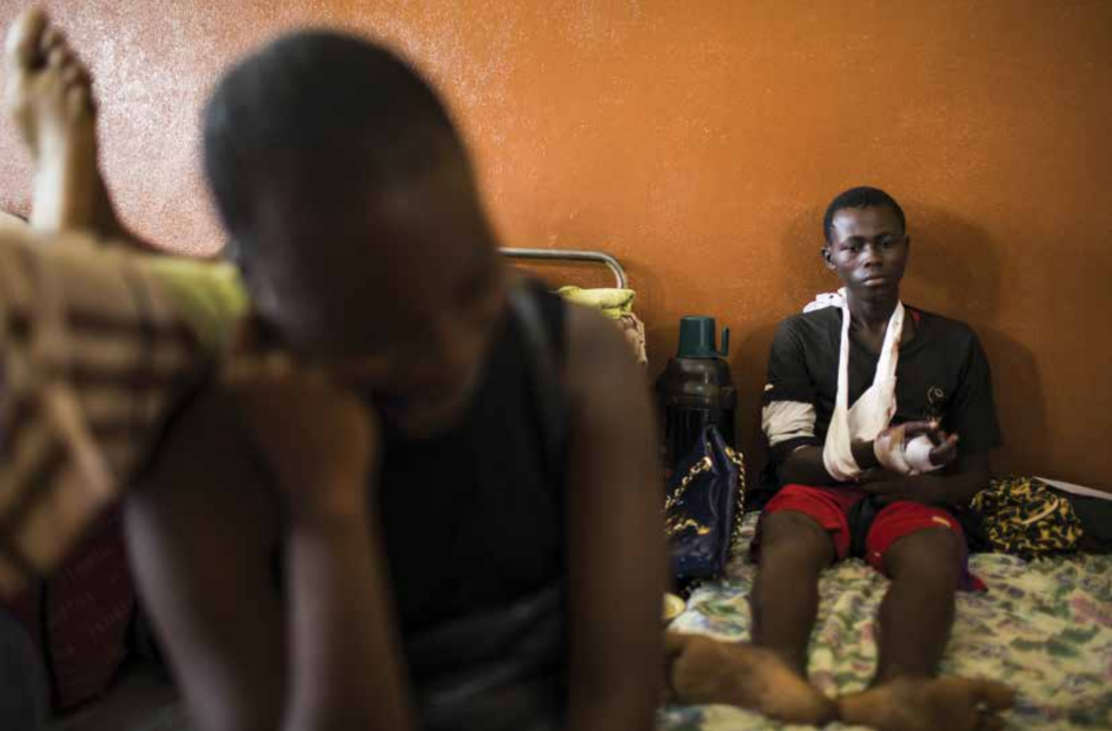
Injured person in Bangui, 19 February 2014

The police and gendarmerie, in particular OPJs, returned to work on around 15 February 2014 with 150 policemen and gendarmes starting to patrol the streets of Bangui. Hopefully more will be recruited. The international forces lend weapons to these law enforcement officers in the daytime (but take them back in the evening) thus contributing to the establishment of at least some security since those causing the instability are all armed.