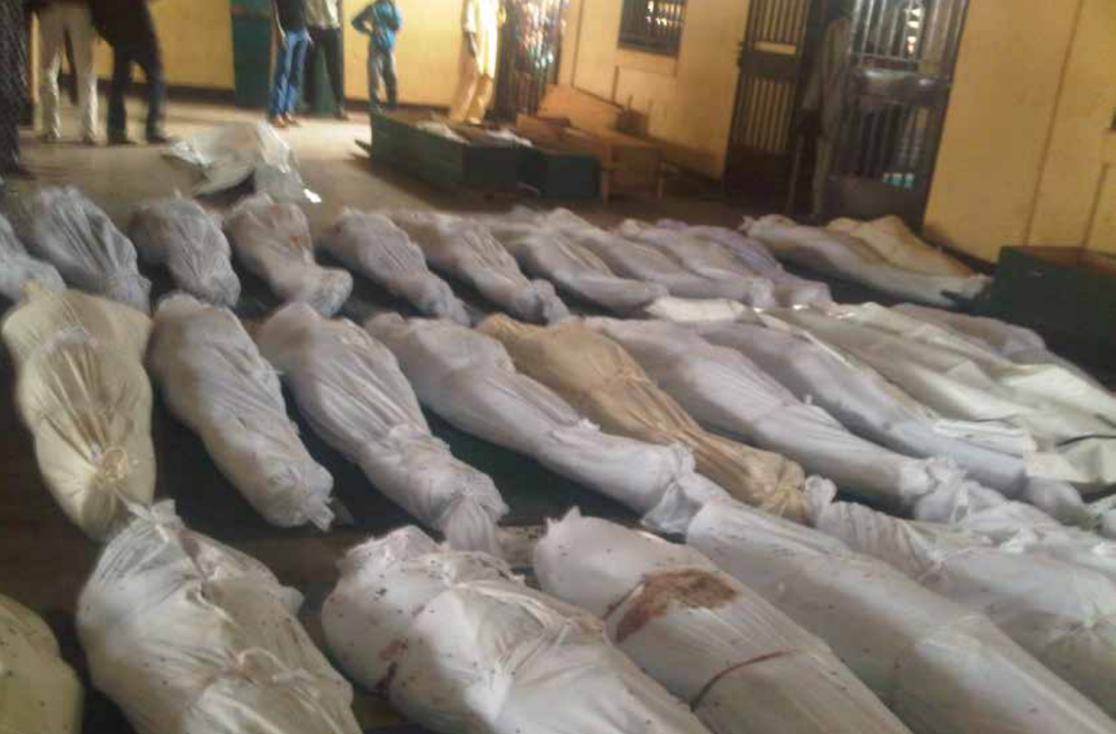
65 bodies laid out in the central mosque in Bangui on 6 December 2013

self-defence militia. Anti-balaka political leaders, undoubtedly all FACA connected to the old regime, sought to capitalise on political/military surprise by launching an attack on a day of ostensible calm. This strategy proved successful in two respects: the militia's rapid arrival en masse in Bangui embodied a strong element of psychological surprise enabling the militia to achieve a foothold in the capital before the deployment of French troops, and thereby securing a fait accompli policy. These militia continue to be present in Bangui at the time of writing.