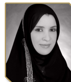
H.E. Dr. Amal Abdullah Al Qubaisi (2015 - present)