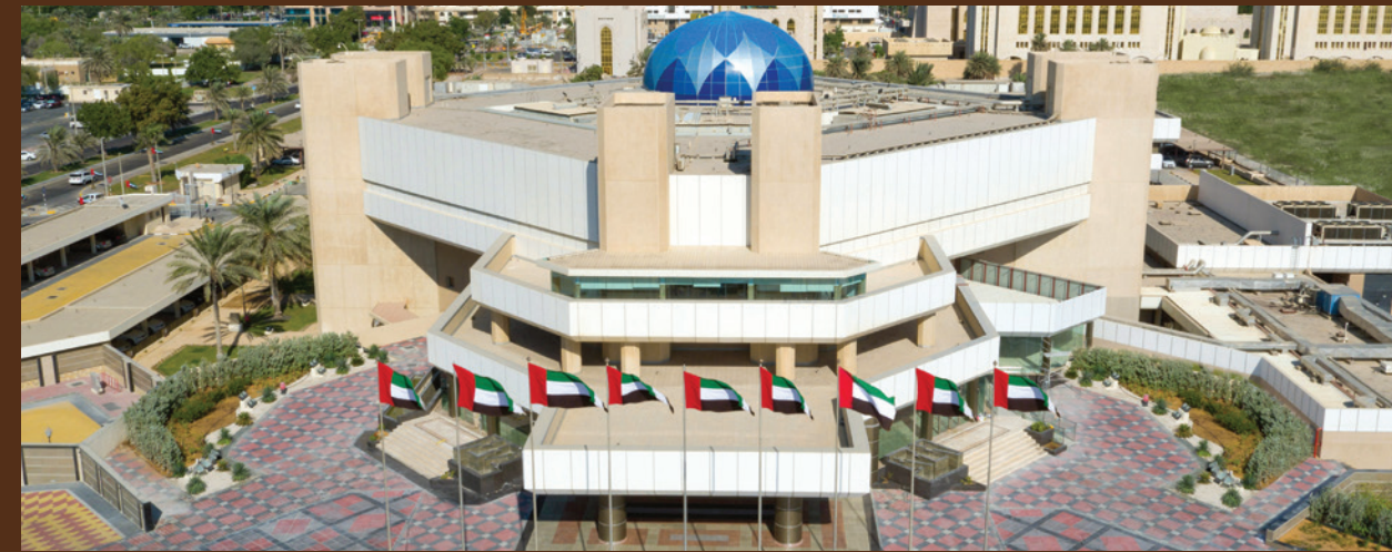
Headquarters of the Federal National Council in Abu Dhabi, Capital of the UAE Federation

Shura (Consultation) was practiced for long decades by the UAE community, before the birth of the UAE federation, and was considered a way of life and an approach to define relations between the ruler and his people. The ruler's majlis (council) was one of the places where views and consultations on different affairs were exchanged, citizen complaints and grievances were heard, and their demands and needs were met.