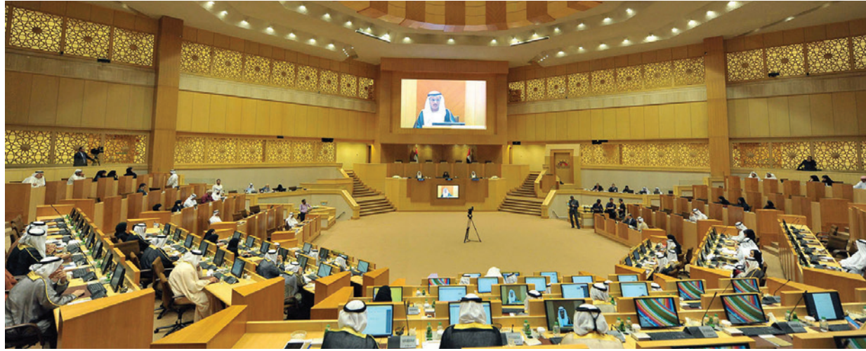
A session of FNC held at Zayed Grand Hall in Abu Dhabi

The FNC mandate, according to the UAE constitution, is divided into two categories: legislative mandate and monitoring mandate.