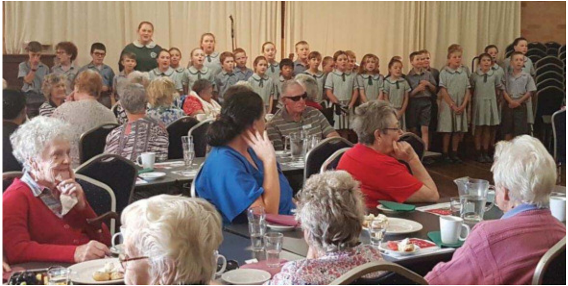
St Marys and the Guyra Preschool provided entertainment for seniors at the Bowling Club