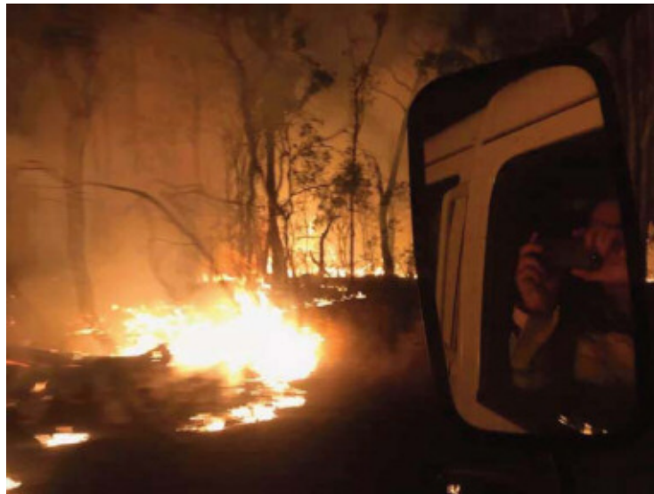
Fire crews arrived too late to save Toppers Mountain wines

Rural Fire Service crews around Inverell were initially alerted to a grass fire in the