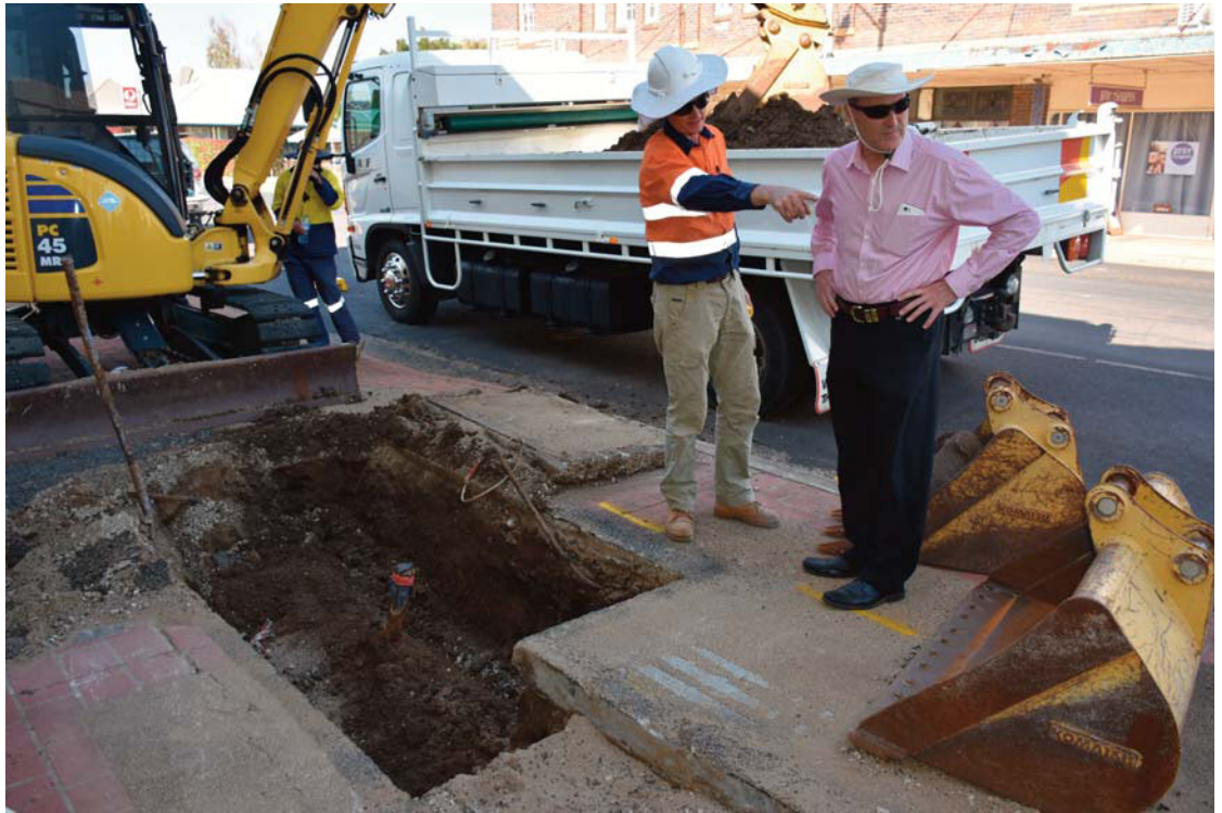
Work has commenced to remove up to 19 underground fuels tanks from Bradley Street

"Once the contractors see the full conditions of the tanks, decisions will be made about which tanks will be removed and which will be stabilised and left in place," he said.