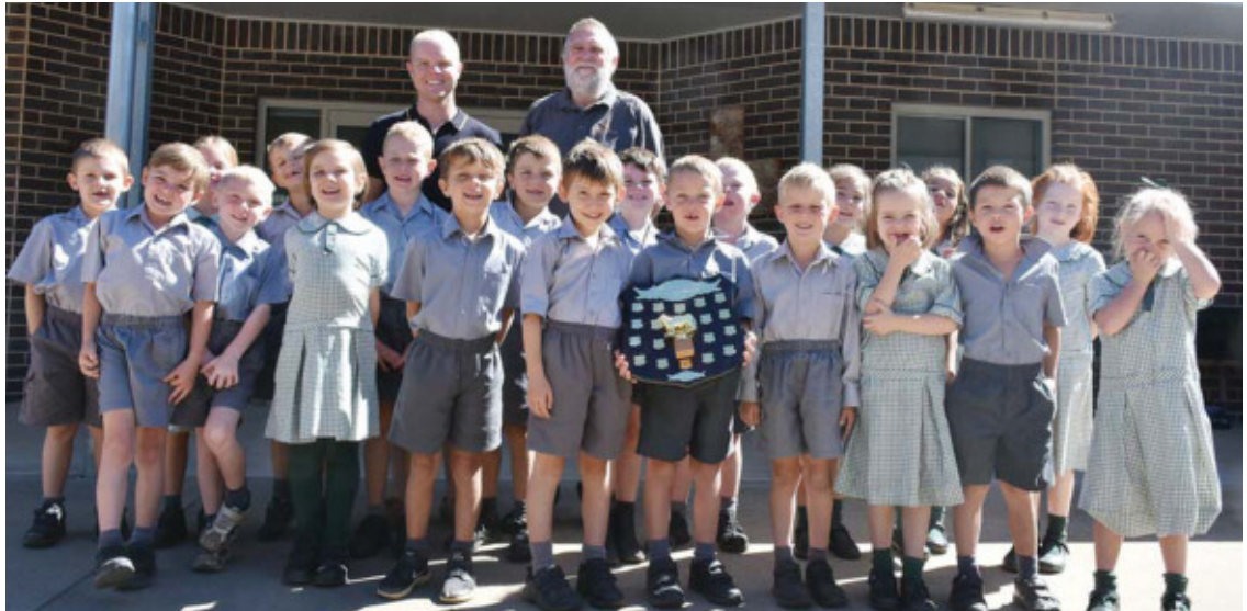
LITTLE BO PEEP COMPETITION: St Marys Kinder Class of 2018

The Guyra Lamb and Potato Festival has thanked the community for getting into the spirit of the festival. Each year they award prizes for the best window display and also the Little Bo Peep Competition.