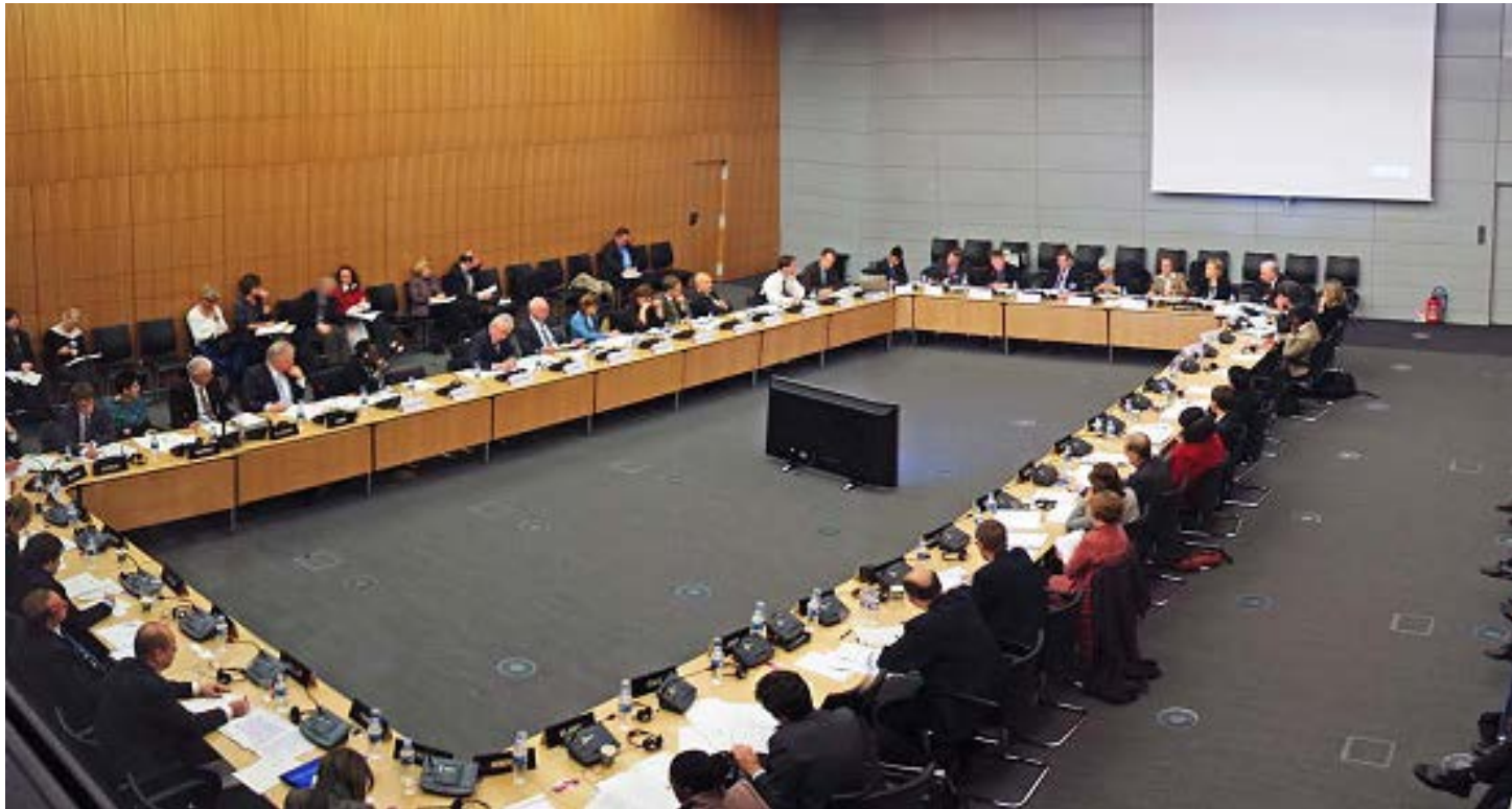
Working Party Meeting