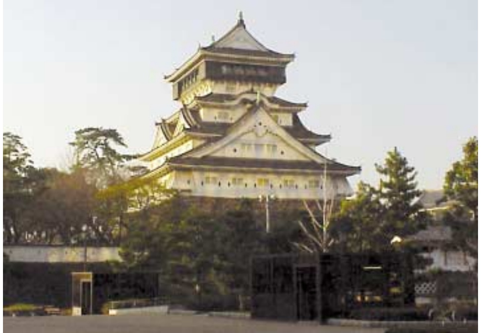
Kokura Castle, located at the center of Kitakyushu, is a symbol of the old-time Japan

Another unique project is “Kitakyushu’s Eco-Town” project. The Eco-Town project is aimed toward becoming a society that recycles more and produces less waste. In July 1997, Kitakyushu was designated as one of the first eco-town areas by the national government.