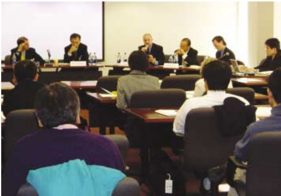
Panel discussion on case studies in emergency management.

tive communications built on strong relationships among city officials and with the community. After each panelist made a short presentation, they discussed some points among themselves and invited members of the audience to ask questions.