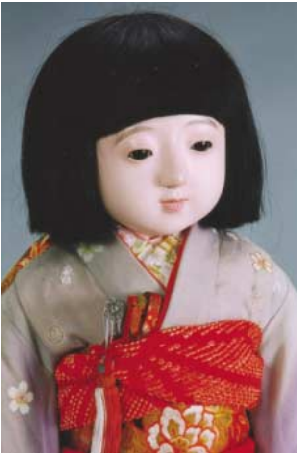
Miss Miyagi Friendship Doll