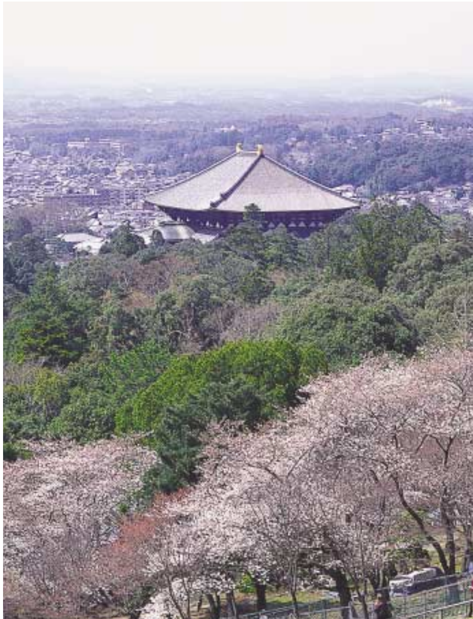
“Historic Assets of Ancient Nara” include Todaiji Temple as part of World Cultural Historic Sites.

For further information, please see the Nara Prefecture Government web site: http://www.pref.nara.jp/