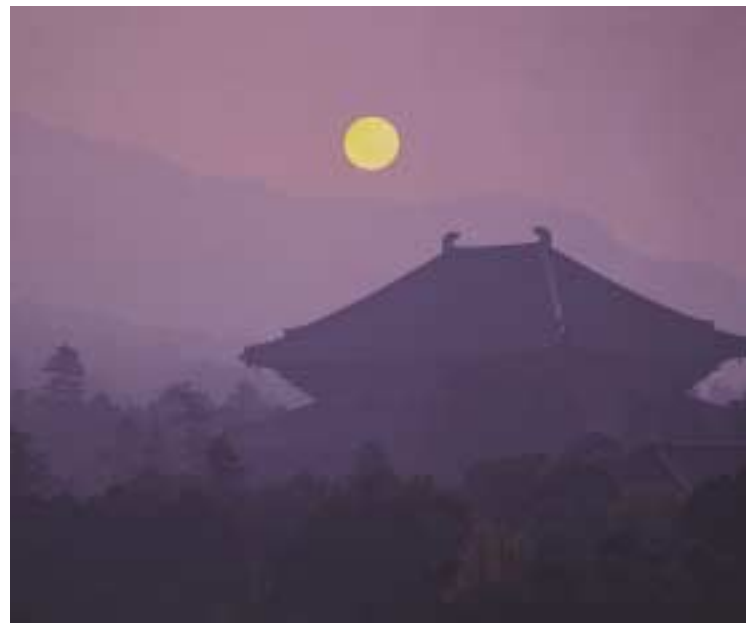
Todaiji Temple silhouetted against a full moon.