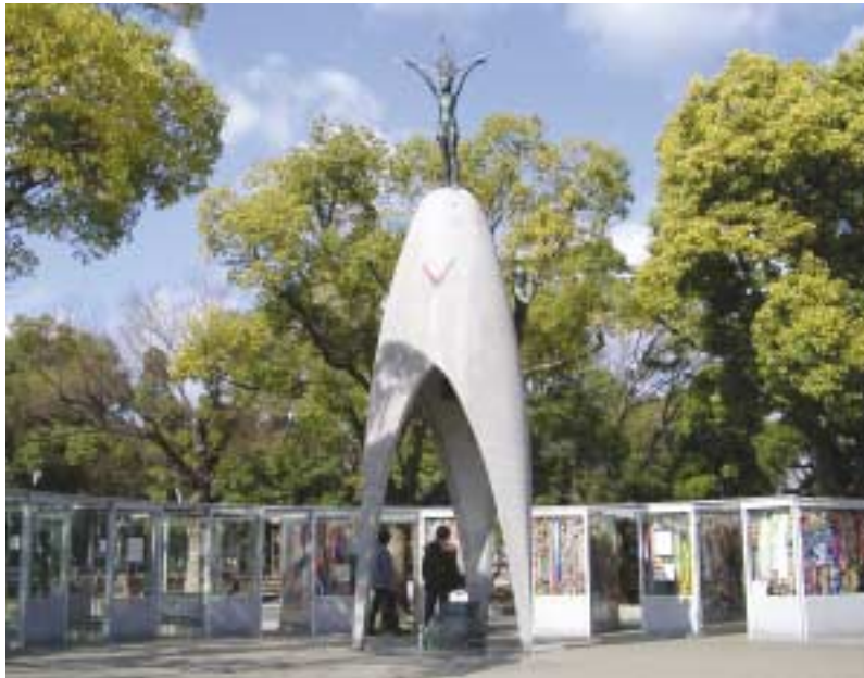
10 million paper cranes are offered annually by visitors as a prayer for world peace at the Children’s Peace Monument in Peace Park, Hiroshima.

For more information, please visit: www.cityhiroshima.jp/shimin/heiwa/crane.html