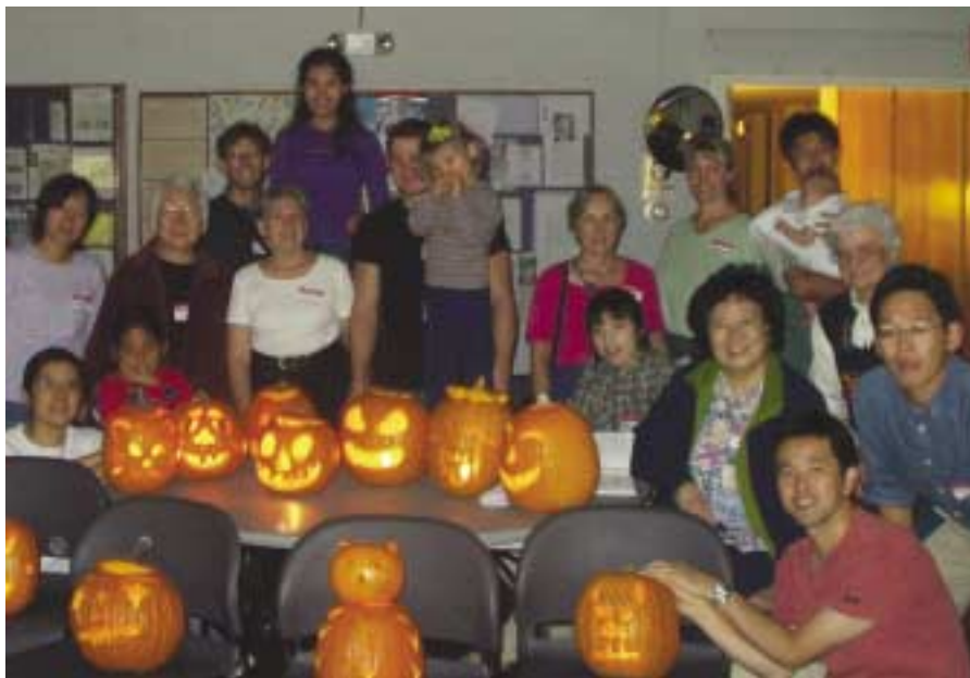
Halloween pumpkin carving with local town people.

The time I spent in the U.S. taught me so much. I sincerely hope that next year’s participants will have a similarly rewarding experience.