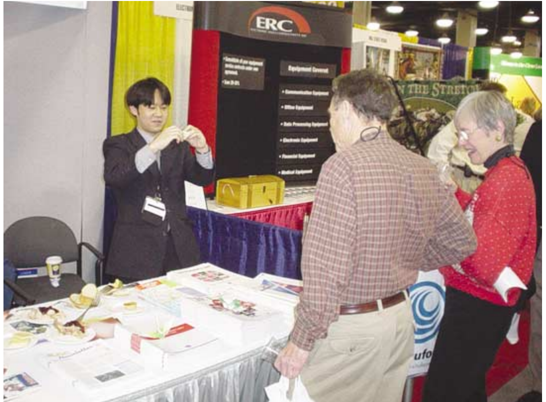
A JLGC staff demonstrates Origami at annual conference of the National League of Cities.

enjoyed the simple things. I am a pretty fair paper folder and always had a fondness for making “origami” (Japanese art of folding paper into decorative shapes and figures). The crane is my specialty, so I started making paper cranes of all sizes and colors. Within the next couple of hours I made over one hundred different cranes and people were stopping by to watch and ask for instruction. I was surprised and delighted by their interest and their willingness to construct a paper crane along with me. When I made a paper crane for an elderly lady and presented it to her, she was delighted and hugged me. My confidence grew. As I instructed young and old in the art of origami I was amazed at how easy it