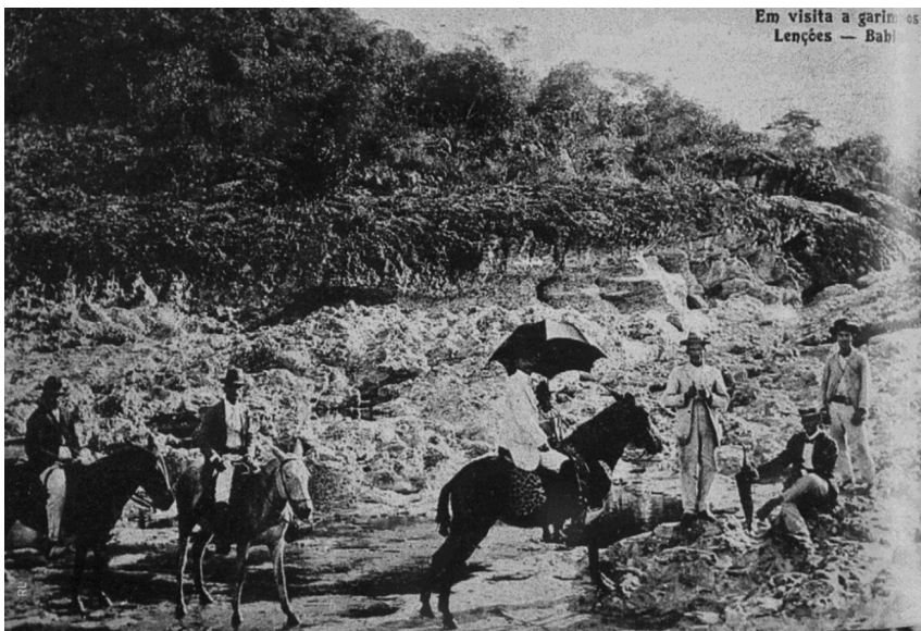
Mine claims owners visiting a diamond washing site in the late nineteenth century (Source: Wilson Teixeira et. al. (2005): 106 citing archive of mestre Oswaldo, Lençóis).

Black diamonds were found along with white diamonds in the gravel beds of the Rio Paraguassu and its tributaries (Rio San Antonio, Rio Mucuge). They were lodged in gravel known locally as cascalho . 14 Owners and leasers of diamond lands allowed miners to work their properties who then received from one-fifth to one-fourth of the value of their finds 15 which could be used to offset debt accumulated by purchasing provisions from the mine claim owner. Diamonds were