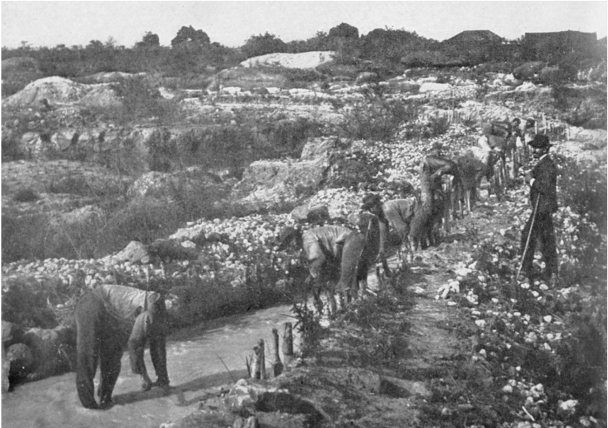
Garimpos concentrating cascalho with hoes in ditches of water ( Source: Photograph taken by H.W. Furniss printed in Orville A. Derby (John Casper Branner tr), "The Geology of the Diamond and Carbonado Washings of Bahia, Brazil," Annual Report of the Smithsonian Institution for the Year Ending June 30, 1906 (Washington D.C.; Government Printing Office, 1907): insert p. 218).

Two kinds of diamonds – carbonados and borts – were used for diamond drill work. The carbonado was only found in Bahia, Brazil. The bort is a semitransparent stone, less tough and with a different crystallization than the carbonado. The much cheaper borts can be used for softer rocks. The carbonado is opaque and black on the outside and of irregular shape. It has no cleavage planes which differentiates it from gemstone diamonds. It is very hard and ideally suited for drilling into hard rock. 26