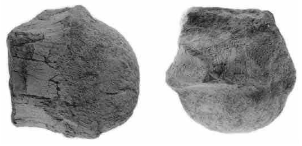
Figure 2. Titanosaurid caudal vertebrae (IGM 6080-2), from Chihuahua, Mexico. Right, lateral view; left, dorsal view. Scale x 0.91.