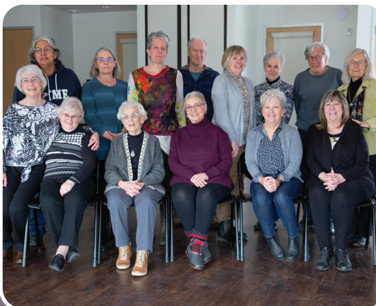
Friends gather at the Annual AGM.