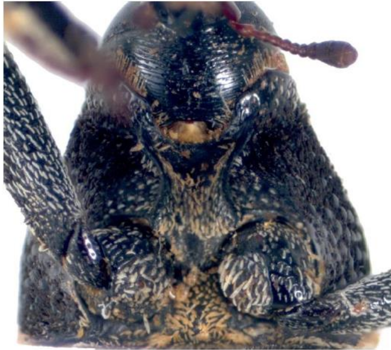
Figure 24. Eudyasmus albertisii Pascoe, 1885, dorsal view. Figure 25. Eudyasmus albertisii Pascoe, 1885, prosternum, ventral view.