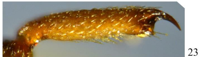
Figures 20-23. Paracamptopsis oblonga Hustache, 1929, type. 20 - dorsal view; 21 - prosternum, ventral view; 22 - lateral view; 23 - protibia.