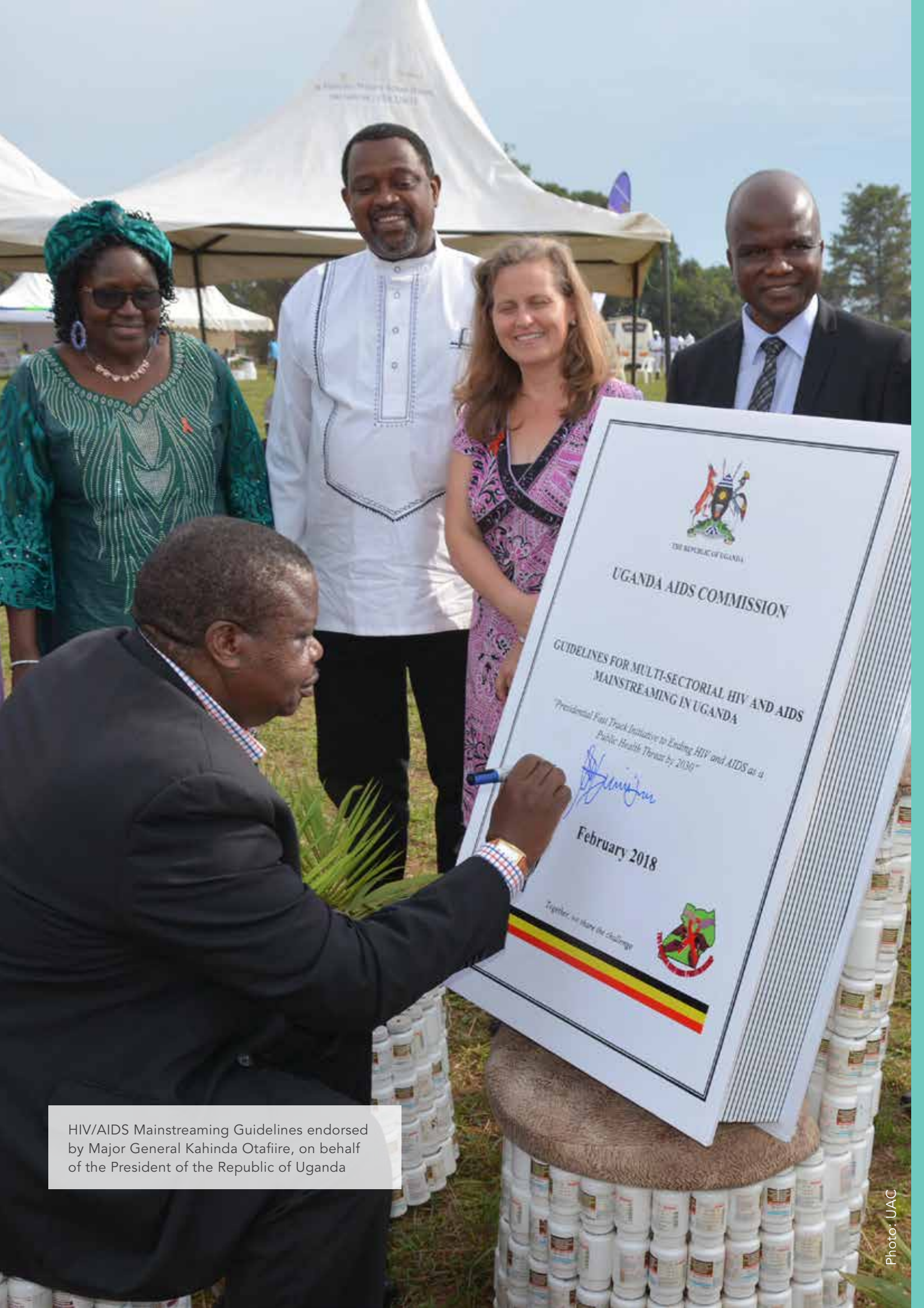
HIV/AIDS Mainstreaming Guidelines endorsed by Major General Kahinda Otafiire, on behalf of the President of the Republic of Uganda