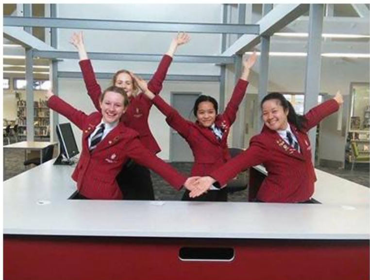
Celebrating the opening of the new Library